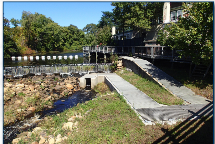
At the bottom of the dam, you can see the opening to the fish ladder. Fish will swim up the ladder so they can get to the top of the dam and continue on their way. The ladder is covered by a metal grate to protect the fish.

The good news is that some very smart people realized that you can have both dams and a fish passage where fish could access those streams that they need to survive. Fisheries scientists and engineers worked together to create " fish ladders " where fish would be able to climb up the dam through a series of wooden boards, similar to steps on a ladder. The fish ladders created a small flow that invited the adult fish to go over each step, rest in a resting pool, and continue to the top of the dam. Depending on how large the dam was, the ladder could be either short or long. As time has gone on, the fish ladders have improved the fish passage experience and engineers have become more creative developing different types of fishways . Some of these fishways mimic nature. They use natural rocks instead of concrete and boards.