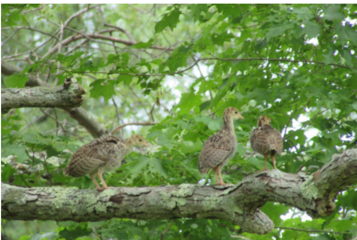
Wild turkey poults, Paul Topham