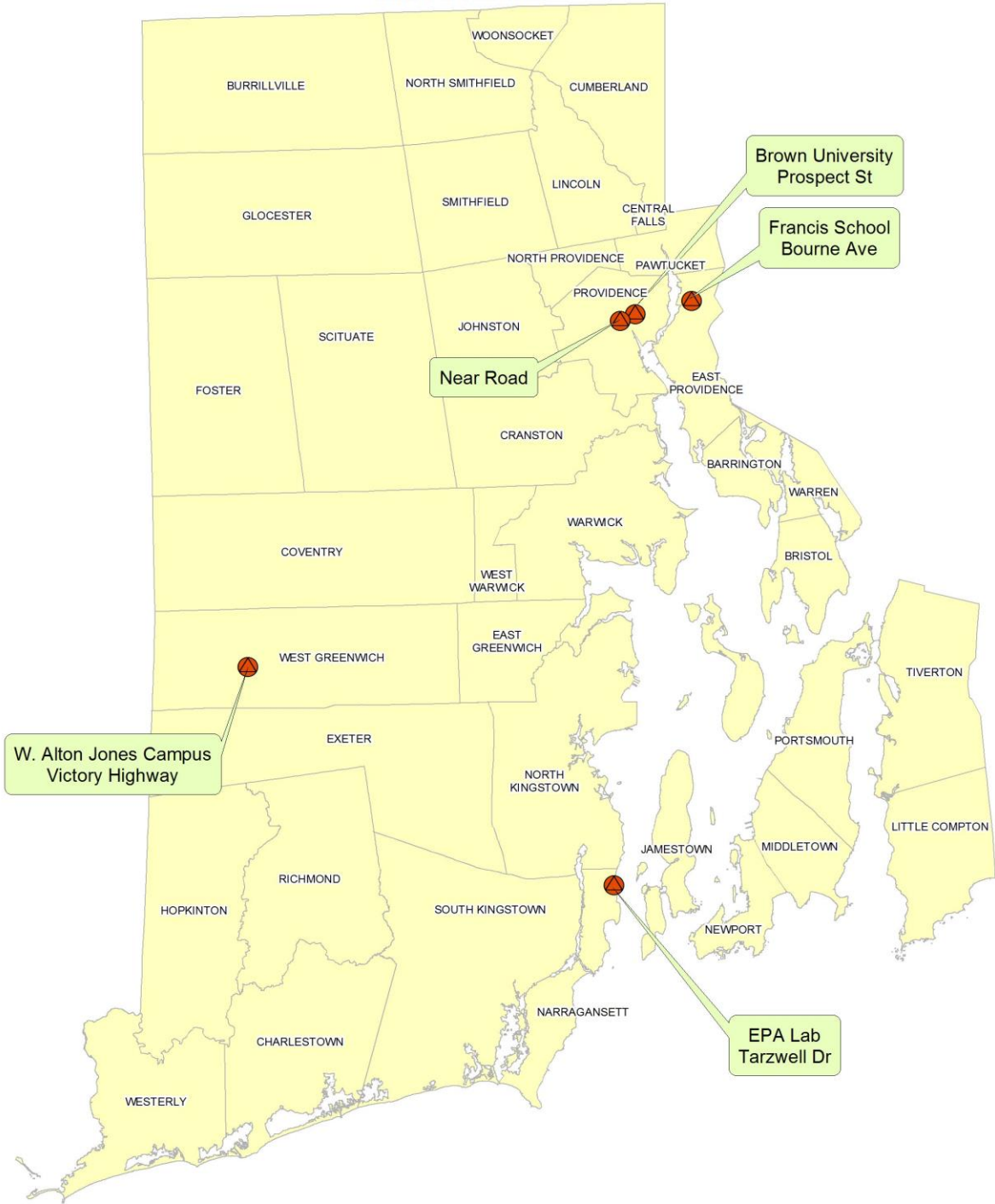
Figure 1 Air Quality Monitoring Network Continous Gas Monitors Site Locations