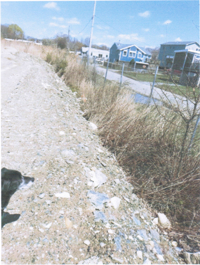
Photo 1 - Eastern Limit of Disturbance