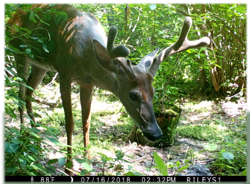
Above: A buck in velvet walks right in front of the camera as he passes through. I watched him nibble at the sweet pepperbush ( Clethra alnifolia ) that grows in abundance on that part of the trail.

battery: 89%. Good, plenty of juice. The camera stops taking night videos when the power gets below a certain percentage, and I don't want to risk missing anything. I haven't had it long enough to know exactly where that line is, so better safe than sorry. On the plus side, the six rechargeable batteries I use to power it last several months without issue. I lock up the camera, pack up my gear, and enjoy the hike back home.