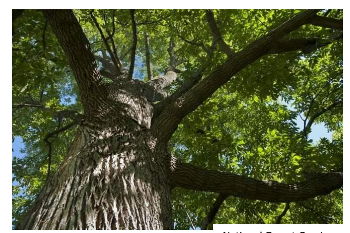
National Forest Service

The ash yellows pathogen (Candidatus phytoplasma fraxini) is transmitted by insects such as leafhoppers and spittlebugs that feed on sap, spreading the disease from tree to tree. The disease is particularly severe in white ash, while disease progression is slower and less severe in green ash. Highly susceptible trees can die in 1-3 years,