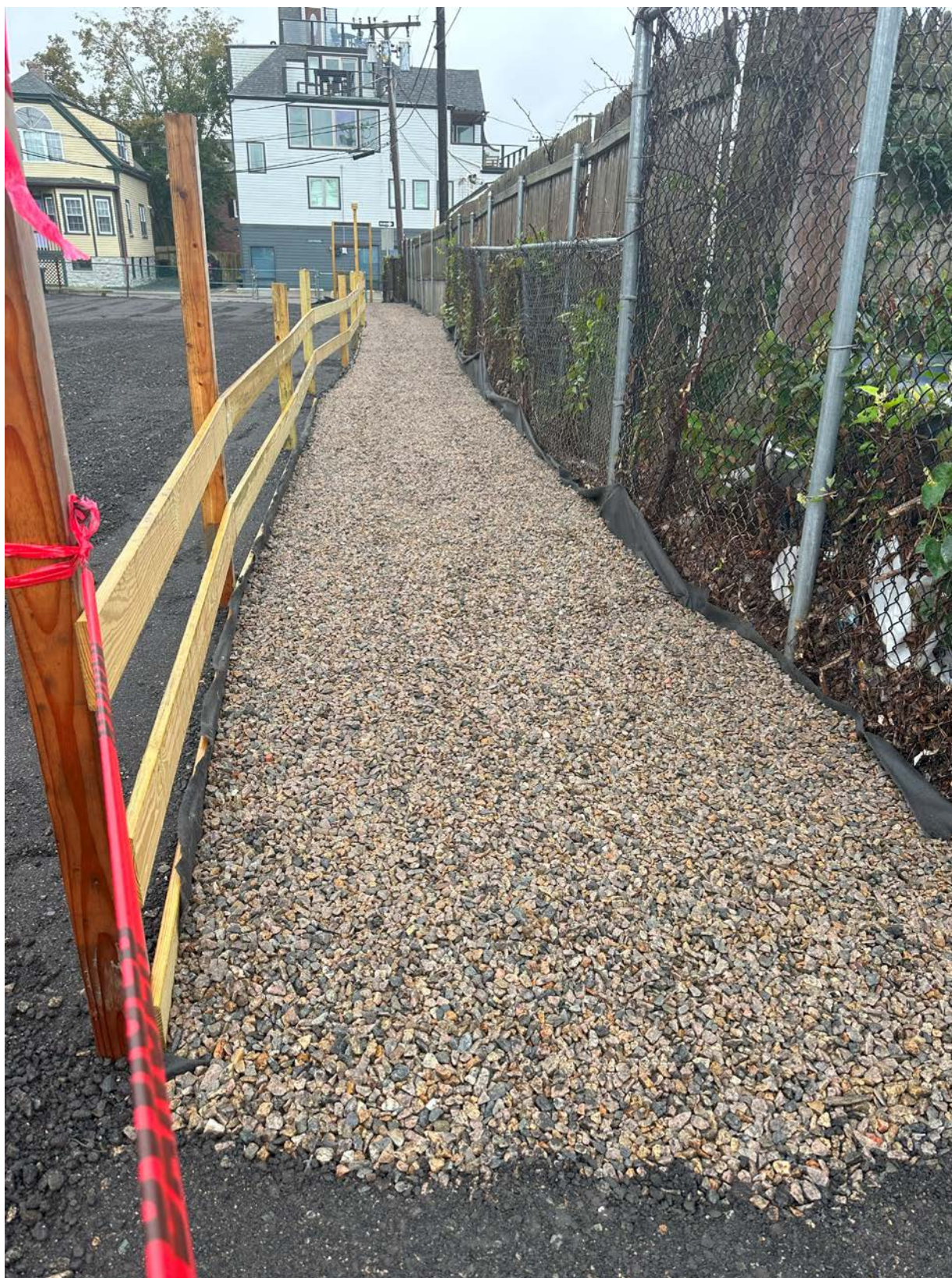
View of finished cap.