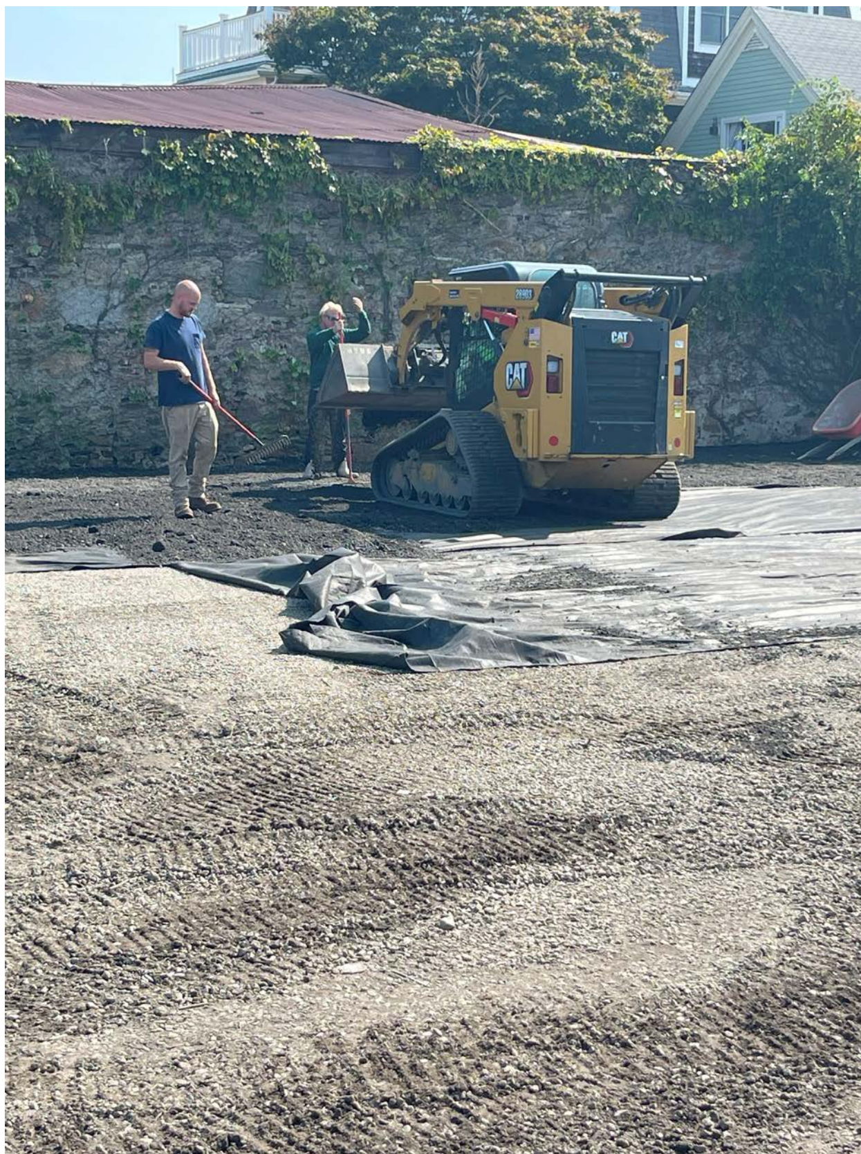
Typical View of fabric placement and reclaimed asphalt capping.