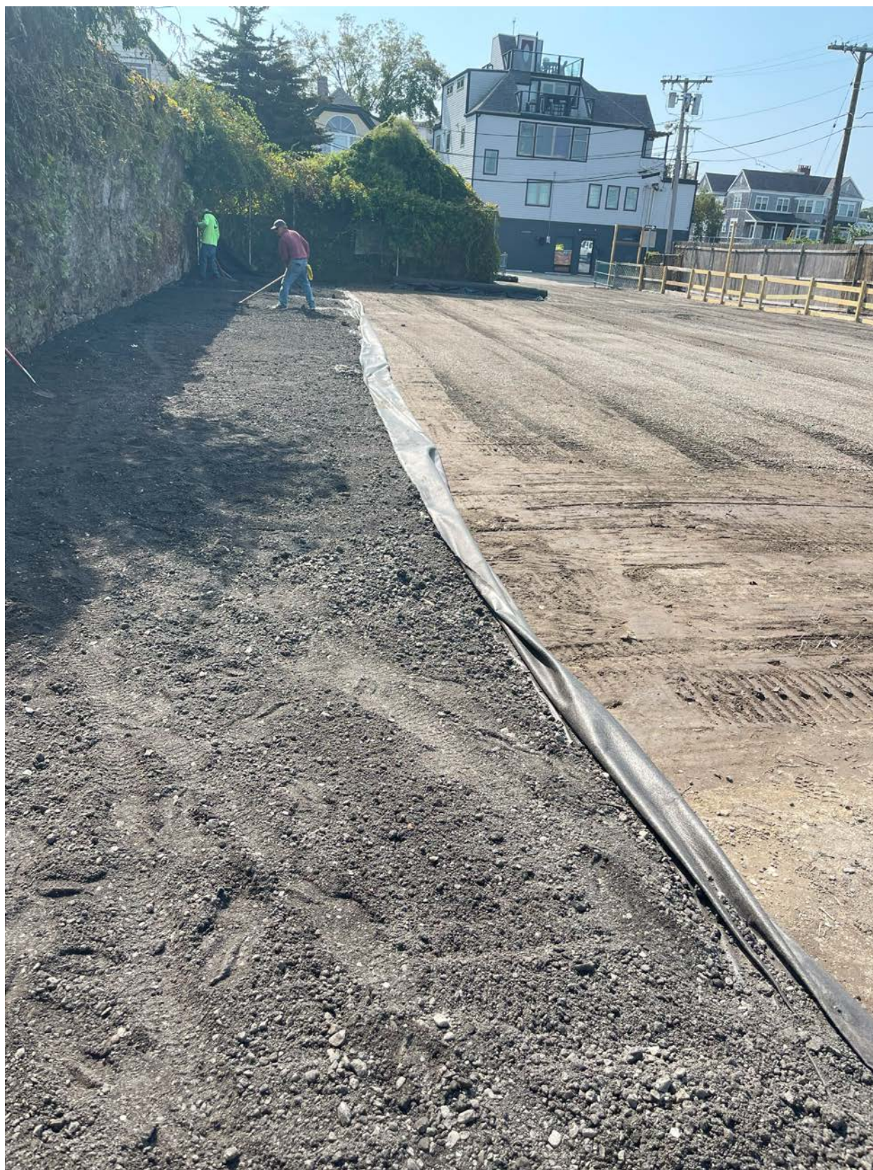
View of fabric/reclaimed asphalt placement.