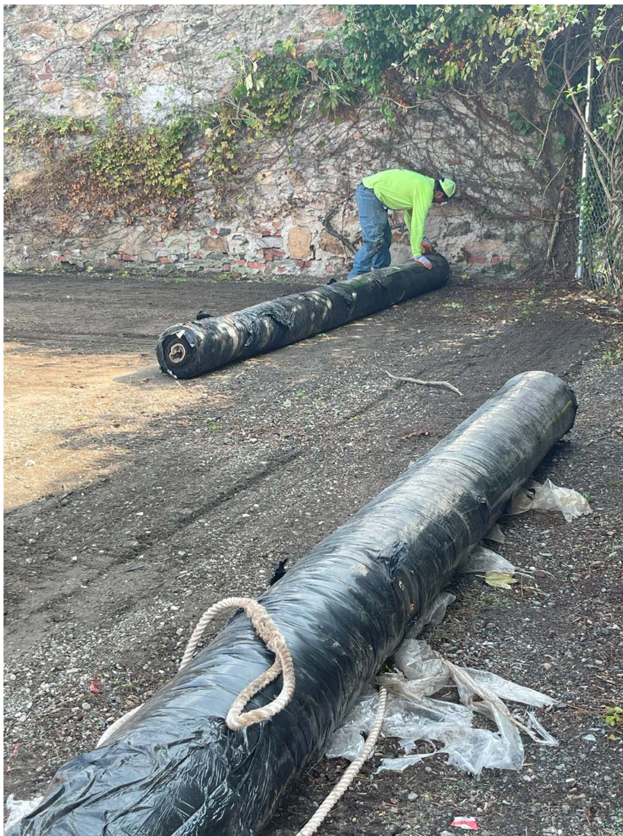
View of fabric placement preparation.