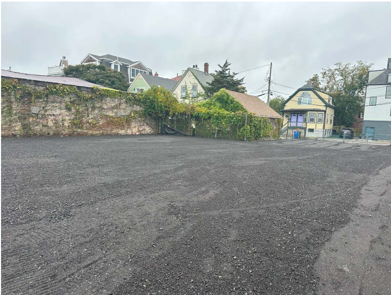
View of finished cap.