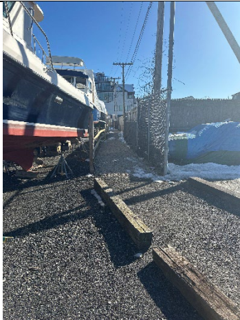
View of temporary cap area.

If you have any questions or concerns, please contact the undersigned at 401-723-9900.