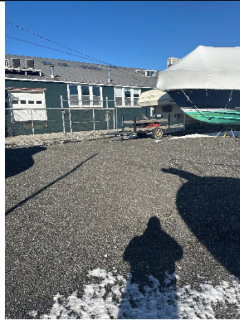
View of temporary cap area.