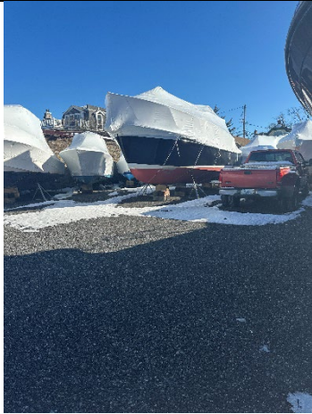
View of temporary cap area.