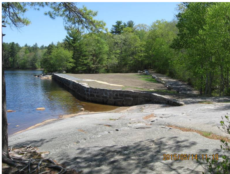
Yawgoog Dam (No. 226) in Hopkinton

The dam was inspected in 2011 and DEM issued an NOV to the owner in 2013 for the unsafe conditions. The owner requested a hearing on the NOV and also worked toward resolving the unsafe conditions. In 2014 the vegetation was removed, the area was inspected and an application to repair the low level outlet was submitted and approved by DEM. Full resolution is expected in 2015.