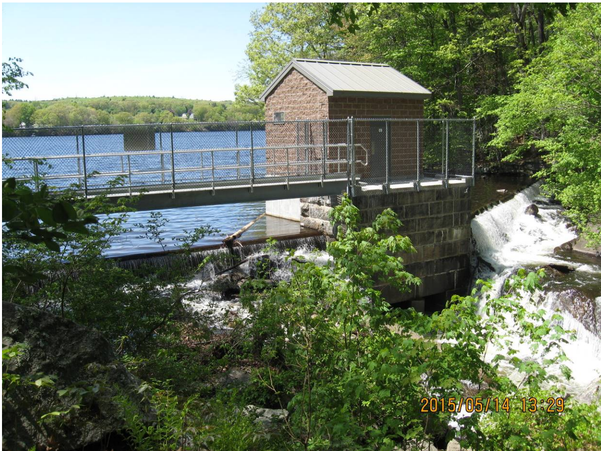
Spillway & low level outlet at Georgiaville Dam (No. 126) in Smithfield, repaired in 2014