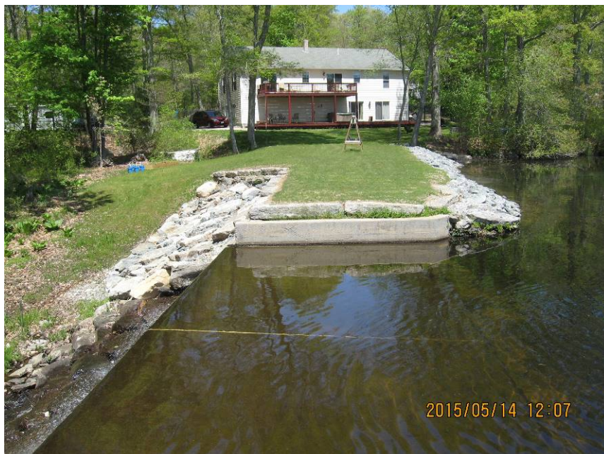
Right section of embankment at Yorker Mill Dam (No. 240) in Exeter, repaired in 2014