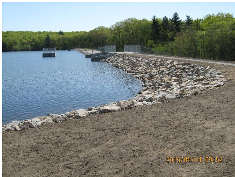
Curran Upper Dam (No. 166), Cranston

In 2008, an engineering consultant was selected to develop the final design for the reconstruction project. Development of the final design plans continued through 2009. In 2010 negotiations proceeded with an adjacent property owner to acquire property to allow reconfiguration of the downstream spillway channel. The current discharge channel places flow along the toe of the earthen embankment; the revised design will move flow away from the dam after it passes the spillway. Efforts to acquire the adjacent property continued through 2011. In October 2012, proposed repair plans were forwarded to the Dam Safety Program for review and an approval was issued in April 2013. The work was well under way in 2014.