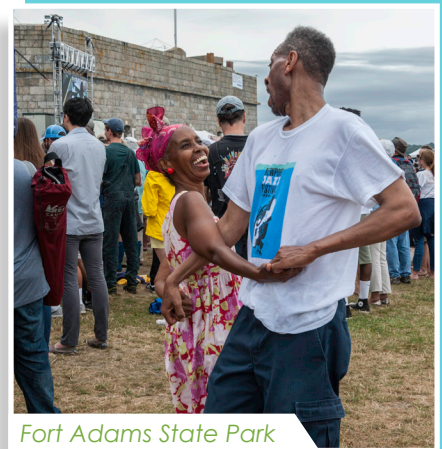
Fort Adams State Park

www.DEM.RI.gov @RhodeIslandDEM /RhodeIslandDEM @RIstateparks