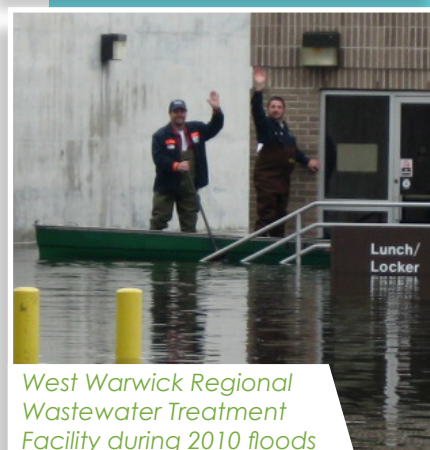
West Warwick Regional Wastewater Treatment Facility during 2010 floods