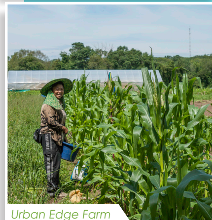
Urban Edge Farm