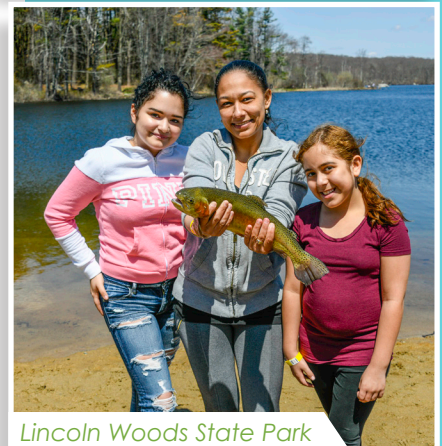
Lincoln Woods State Park