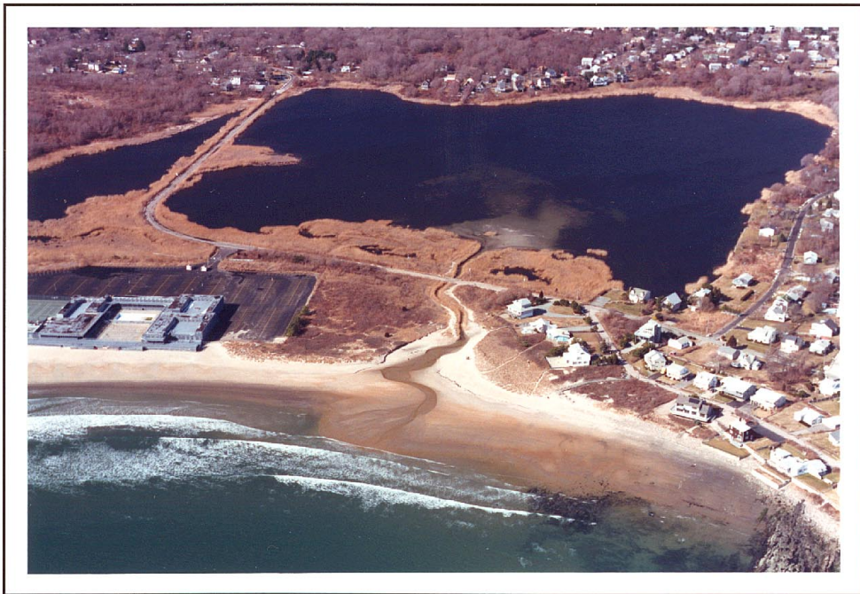
Looking north at low tide on 17 March 1999, Wesquage Pond (#19).