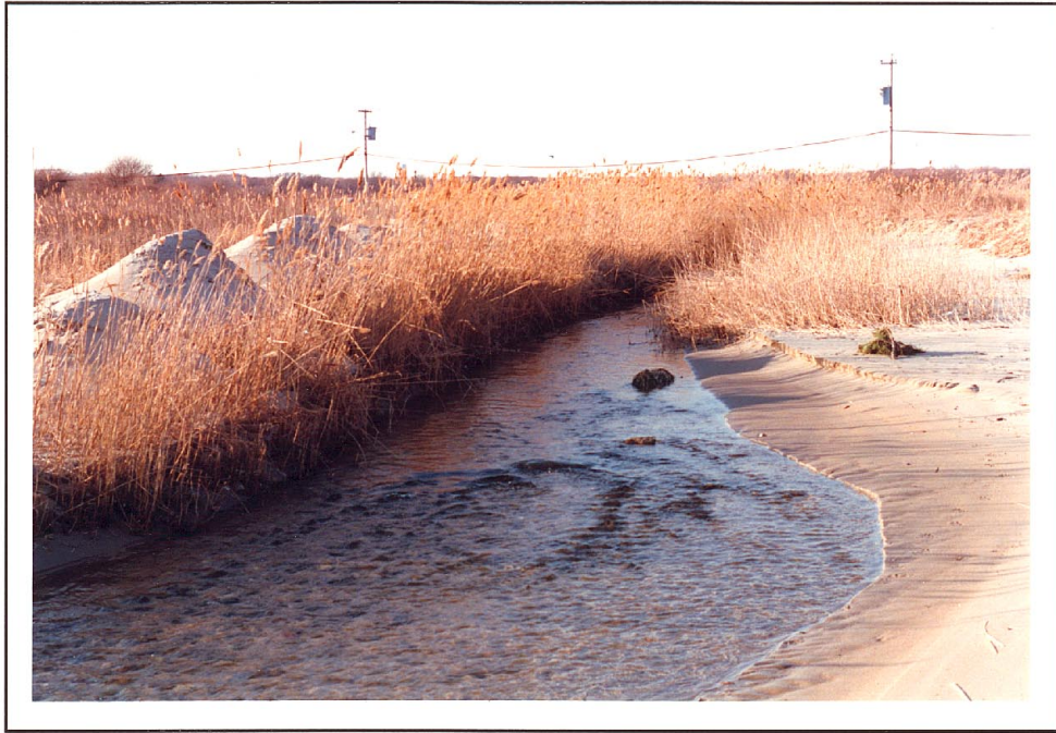
Looking north at channel, just north of proposed sediment dike location at low tide on 18 March 1999, Wesquage Pond (#19).