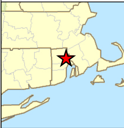
Location of Site