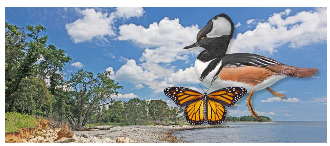
A Field Guide to Long Island Sound

Please use the form on the following page to register.