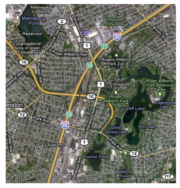
Figure 3: Partial aerial view of the Roger Williams Park Ponds watershed.

Roger Williams Park Ponds is a Class B freshwater lake, and its applicable designated uses are primary and secondary contact recreation and fish and wildlife habitat (RIDEM, 2009). From 2001-2005, water samples were collected from three sampling locations (WW37, WW140, WW295) and analyzed for the indicator bacteria, fecal coliform. The water quality criteria for fecal coliform, along with bacteria sampling results from 2001-2005 and associated statistics, are presented in Table 1. The geometric mean and 90<sup>th</sup> percentile maximum was calculated for station WW37 and exceeded Rhode Island's water quality criteria for fecal coliform. Statistics were not calculated for stations WW140 and WW295 as there were insufficient data to calculate these values.