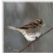
White- throated Sparrow