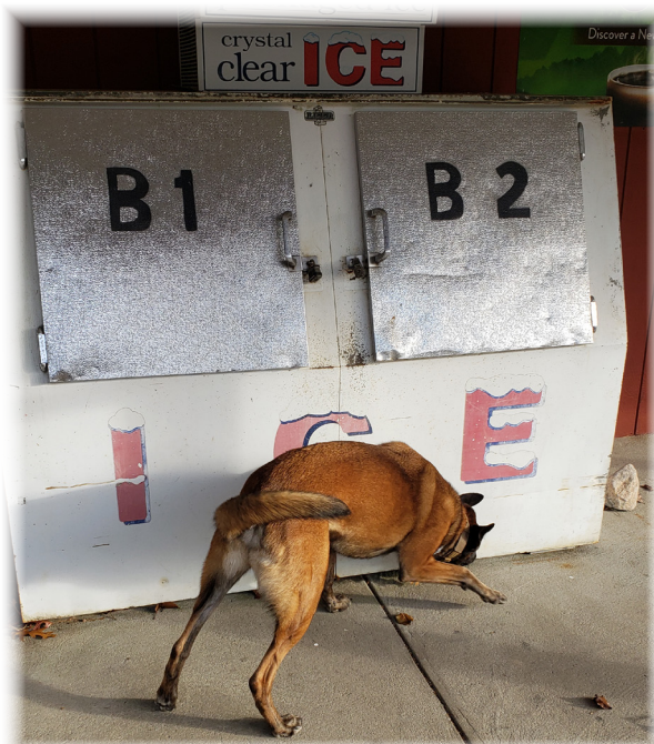
K-9 Bear shows off his searching skills. Good job, Bear!