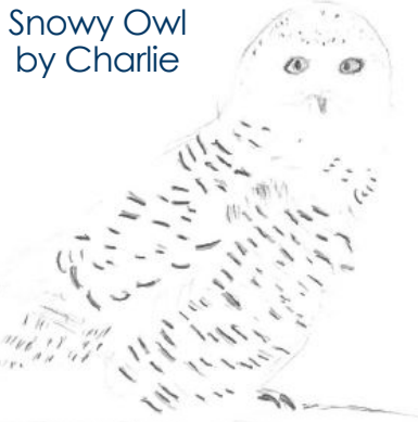
Snowy Owl by Charlie