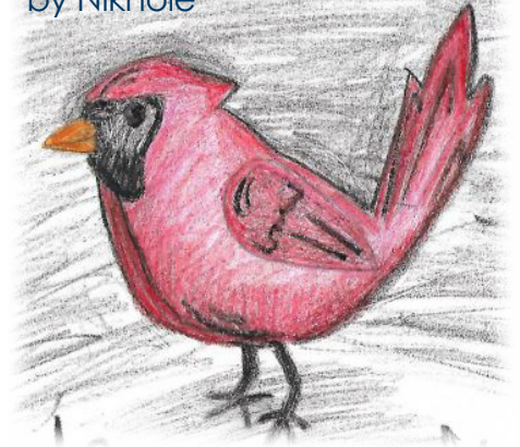
Northern Cardinal