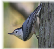
White- breasted Nuthatch