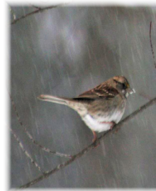
White- throated Sparrow