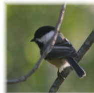
Black- capped Chickadee