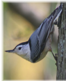
White- breasted Nuthatch