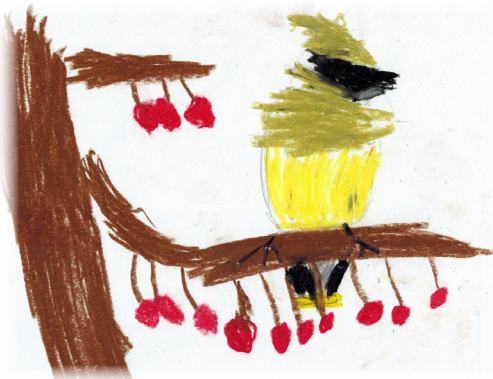
Cedar Waxwing by Caedmon