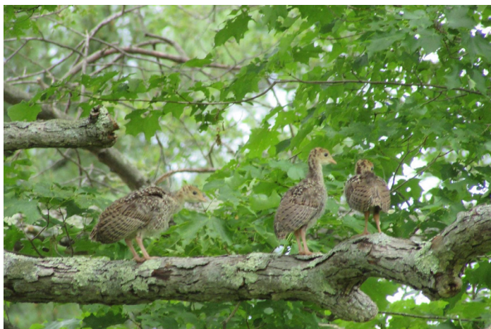
Wild turkey poults, Paul Topham