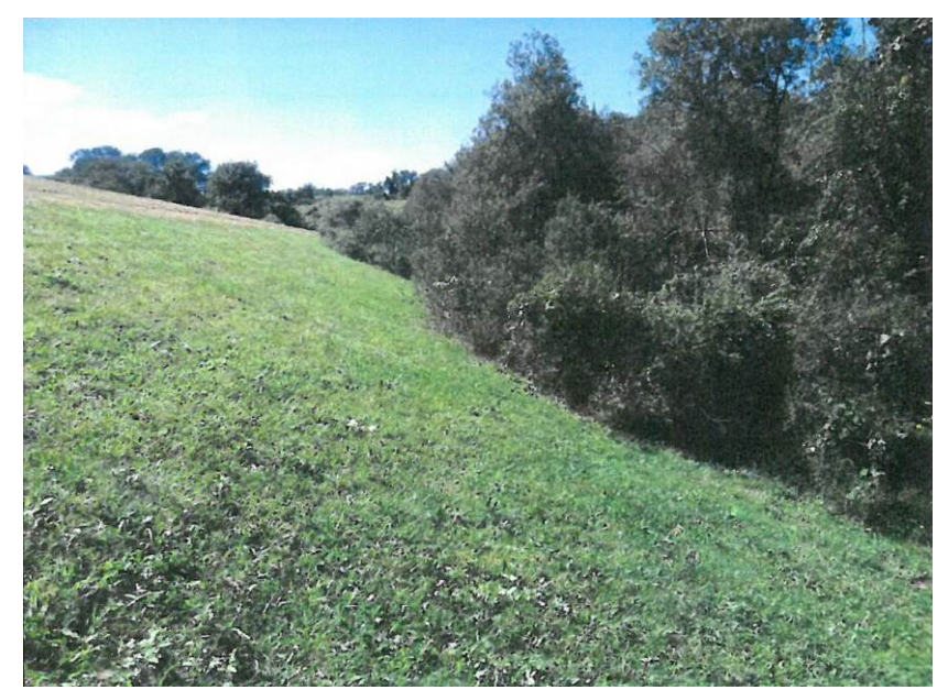
Overgrown downstream slope of Watson Dam (No. 485) in Little Compton

The dam was inspected in 2013 and DEM issued an NOV to the City of Newport in April 2016 for the unsafe conditions. The City requested a hearing on the NOV and also met with DEM in May 2016 to discuss resolution of the matter.