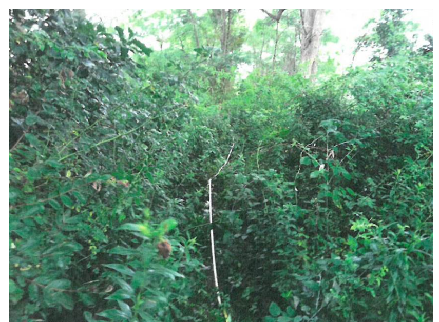
Overgrown crest (typical of entire dam) of Warren Upper Dam (No. 480) in Warren

The dam was inspected in 2012 and DEM issued an NOV to the Bristol County Water Authority (BCWA) in 2014 to address the unsafe conditions. The BCWA requested a hearing on the NOV and in 2016 was investigating removal of the dam.