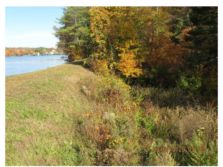
Improper vegetation at Waterman Dam (No. 111) in Glocester

The dam was inspected in 2012 and DEM issued an NOV to the owner in 2014 for the unsafe conditions. The owner did not request a hearing on the NOV, but has made progress in resolving the unsafe conditions.