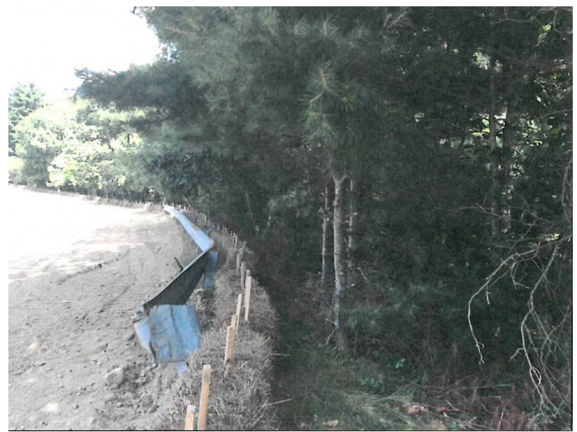
Overgrown downstream side of dike at Gainer Dam (No. 161) in Scituate

The dam was inspected in 2014 and DEM issued an NOV to the City of Providence and the Providence Water Supply Board (PWSB) in November 2016 for the unsafe conditions. The City and PWSB requested a hearing on the NOV and also met with DEM in December 2016 to discuss resolution of the matter.