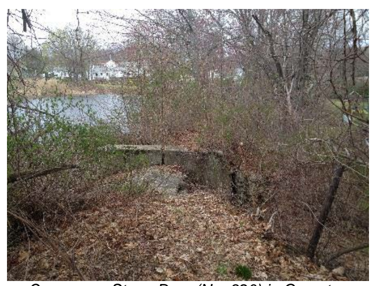
Overgrown Stone Dam (No. 320) in Cranston

The dam was inspected in 2013 and 2015 and DEM issued NOVs to the owners in August 2016 for the unsafe conditions. Both owners requested hearings on their NOVs.