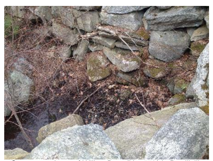
Seepage at base of Wilbur Dam (No. 572) in Burrillville

The dam was inspected in 2013 and 2015 and DEM issued an NOV to the owner in May 2016 for the unsafe conditions. The owner did not request a hearing on the NOV.