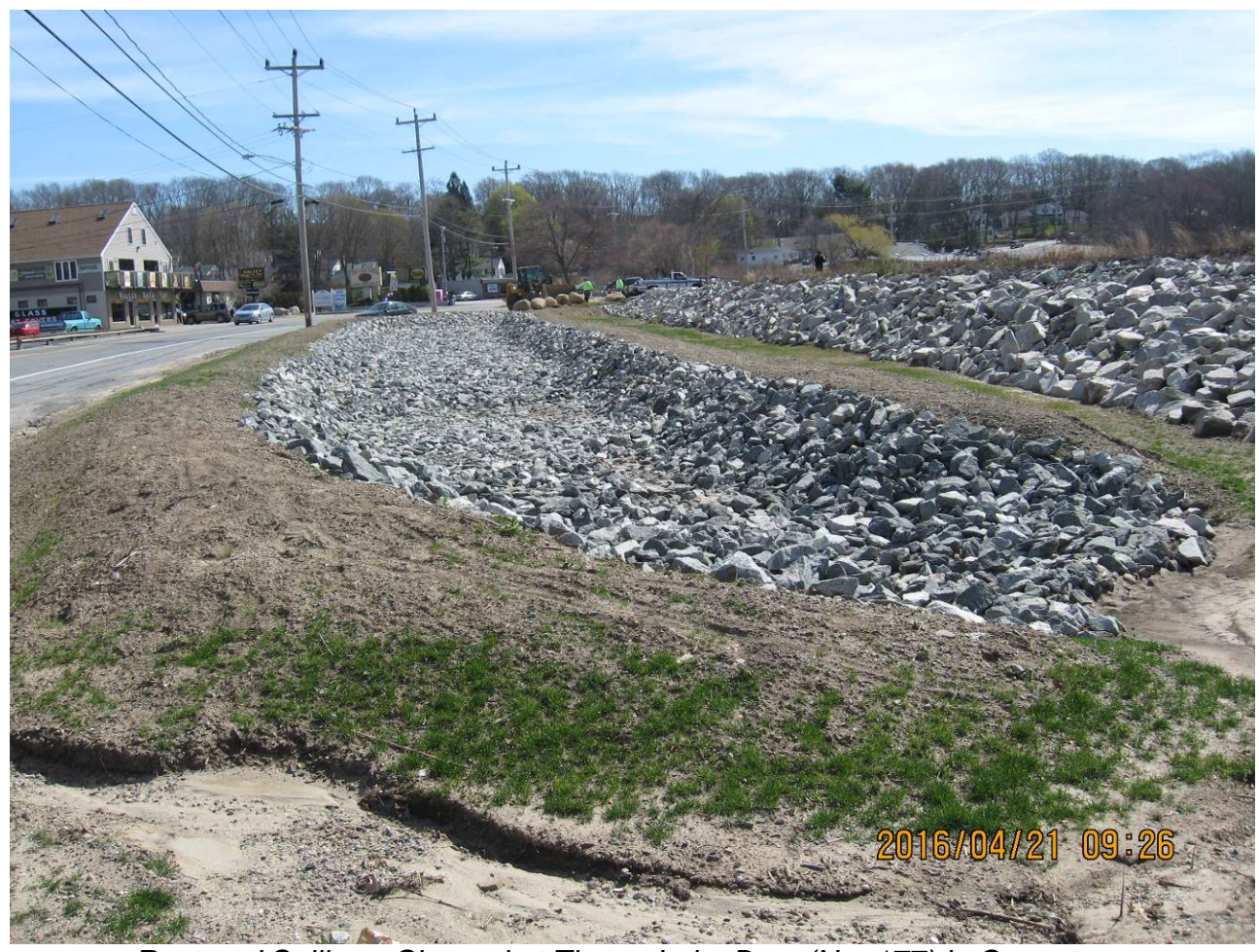
Restored Spillway Channel at Tiogue Lake Dam (No. 177) in Coventry