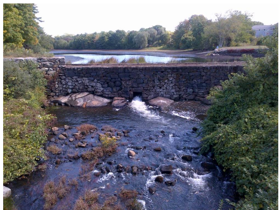
Spillway & leaking low level outlet at Wyoming Upper Dam (No. 216) in Hopkinton/Richmond

Dam number 216 (Wyoming Upper) in Hopkinton/Richmond An engineering consultant has completed about 60% of the repair design.