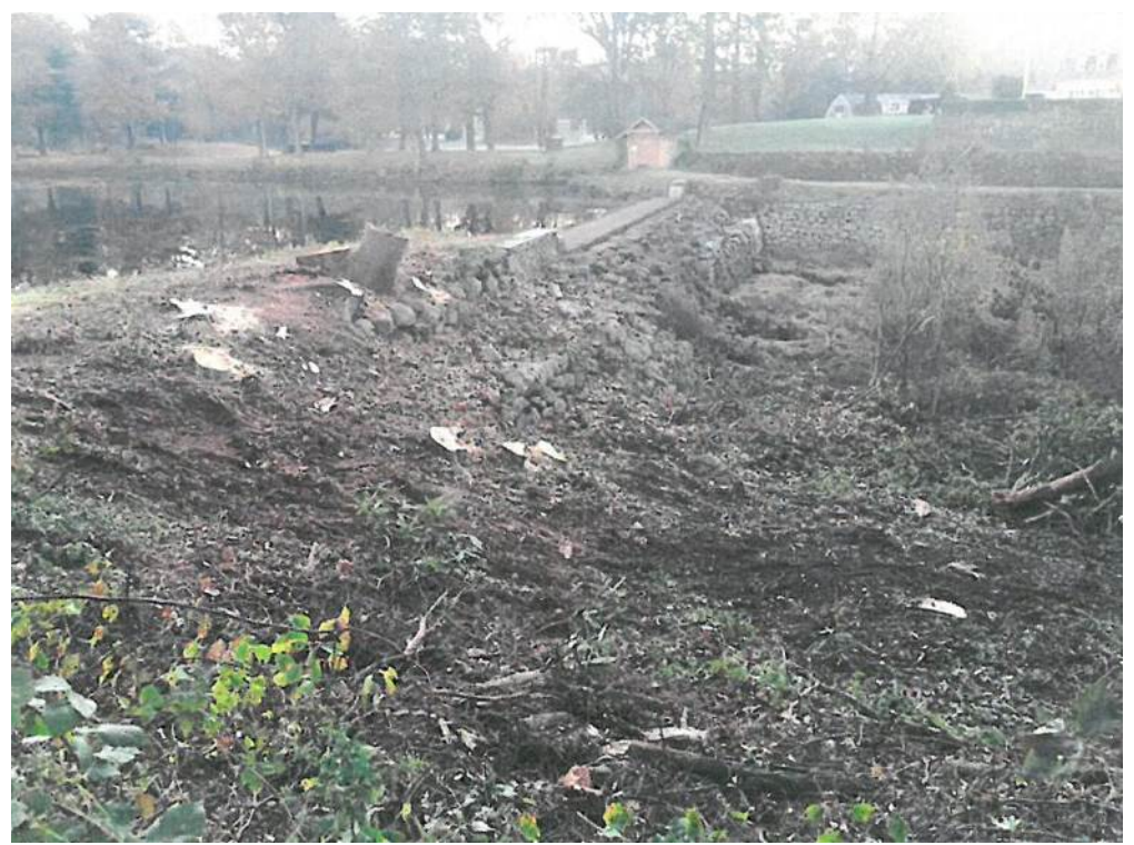
Peace Dale Dam (No. 426) in South Kingstown, after vegetation removal

The dam was inspected in 2013 and DEM issued an NOV to the owner in January 2017 for the unsafe conditions. The owner requested a hearing on the NOV and also met with DEM in February 2017 to discuss resolution of the issues.