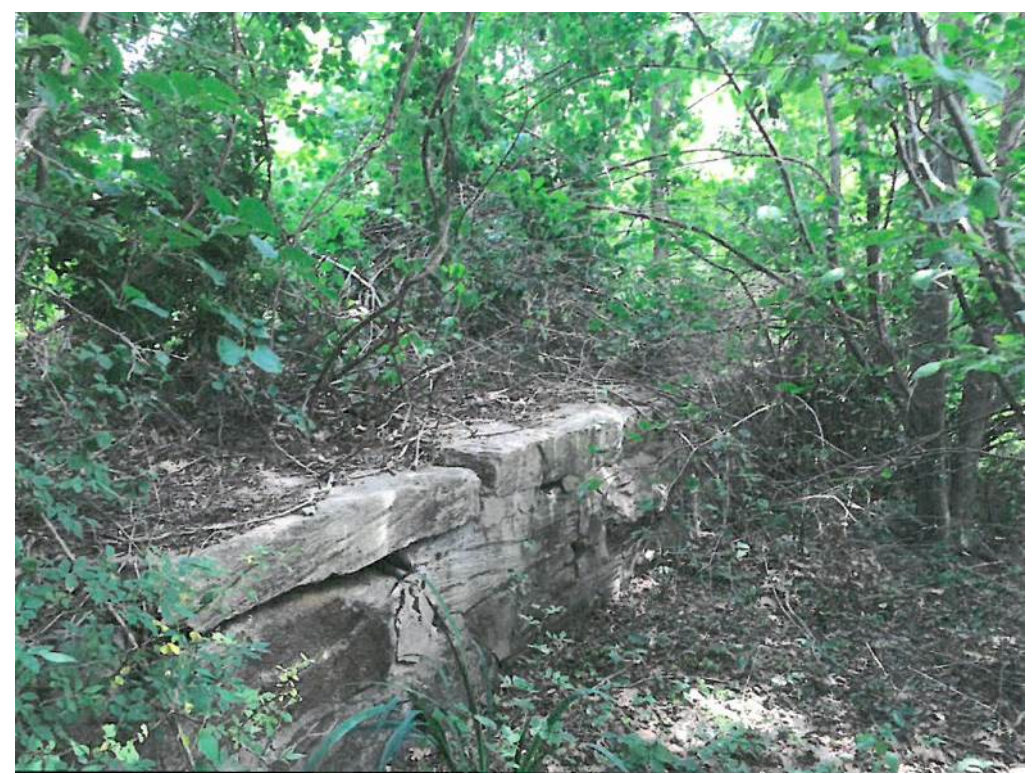
Overgrown embankment at Slatersville Middle Dam (No. 046) in North Smithfield

The dam was inspected in 2016 and DEM issued an NOV to the owner in September 2017 for the unsafe condition. The owner requested a hearing on the NOV and also met with DEM In November 2017 to discuss resolution of the matter.