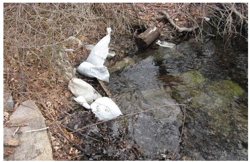
Sand bags that were apparently used to block flow into the spillway conduit at Creamer Dam (No. 742) in Tiverton