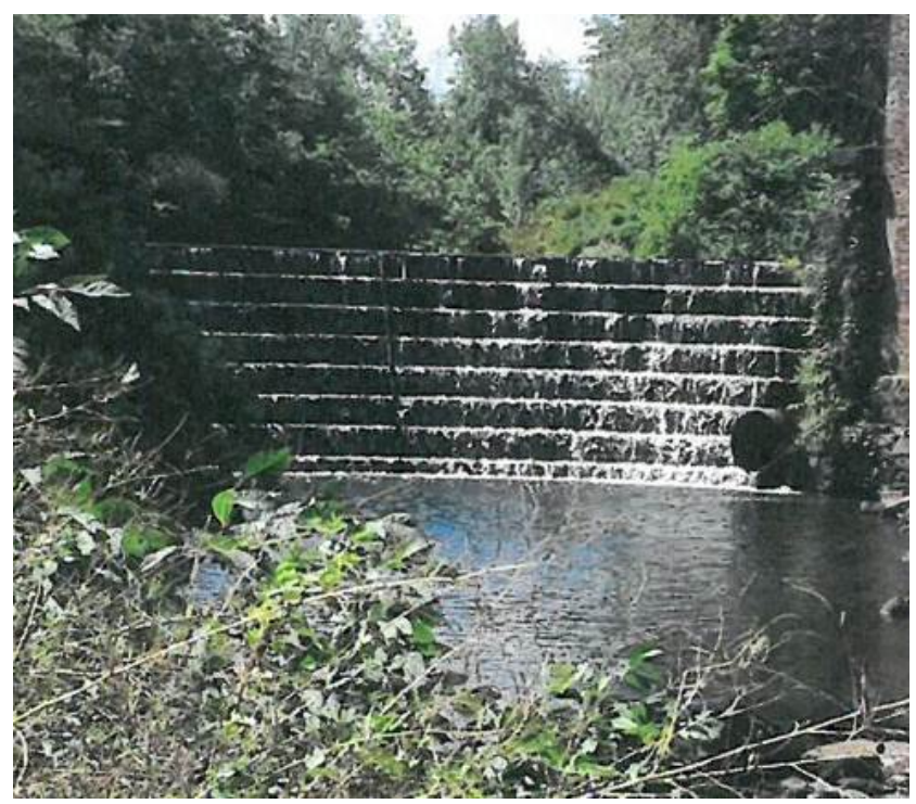
Spillway at Centerville Dam (No. 149) in West Warwick