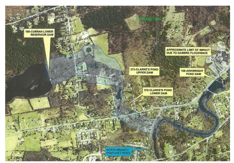
Hypothetical flood due to catastrophic failure of Curran Lower Dam (No. 198) in Cranston

Dam number 216 (Wyoming Upper) in Hopkinton/Richmond An engineering consultant has completed about 60% of the repair design.