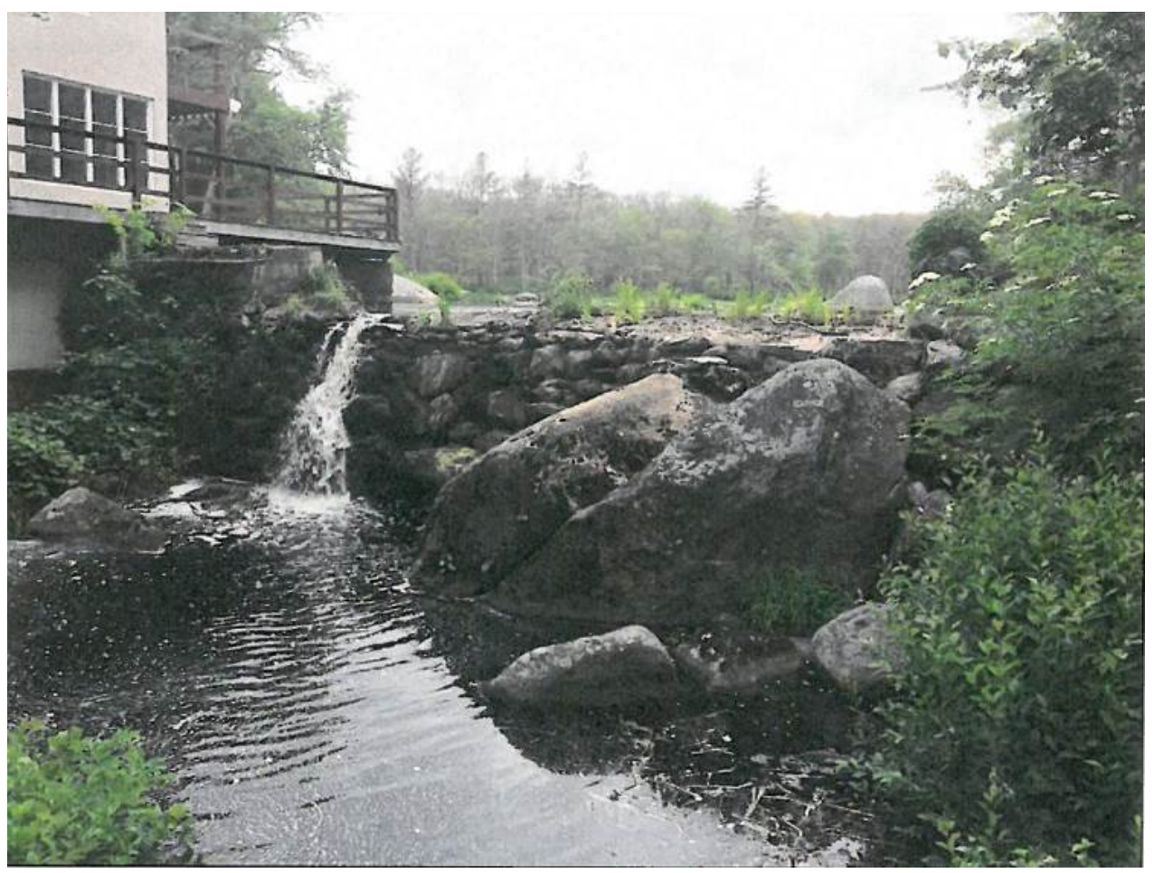
Spillway at Spear Dam (No. 349) in Foster