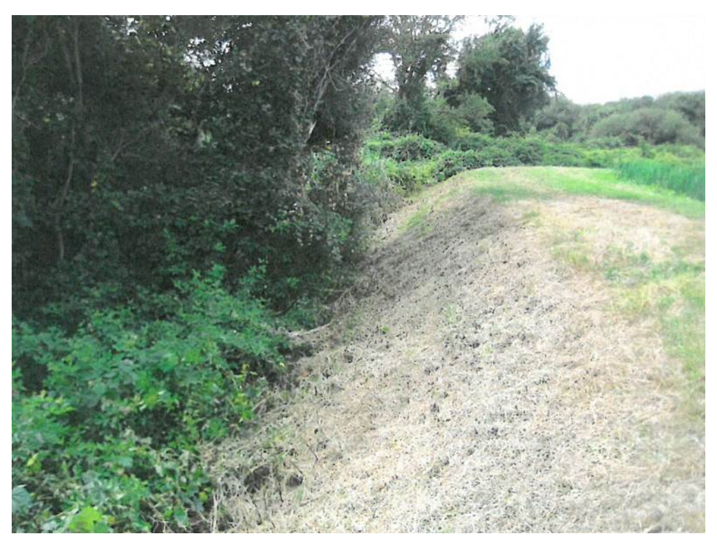
Improper vegetation on downstream slope of Jamestown Lower Dam (No. 575) in Jamestown

The dam was inspected 2012 and DEM issued an NOV to the Town of Jamestown in 2013 for the unsafe conditions. The Town did not request a hearing on the NOV and hired an engineer to develop plans to rehabilitate the dam. In 2016, the Town pursued funding for a comprehensive repair of the dam. In October 2017, the Town submitted repair plans to DEM.