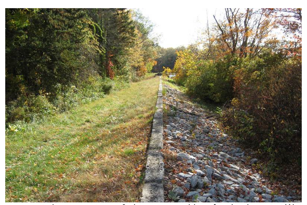
Improper vegetation on upstream & downstream sides of embankment at Waterman Dam (No. 111) in Glocester/Smithfield

The dam was inspected in 2012 and DEM issued an NOV to the owner in 2014 for the unsafe conditions. The owner did not request a hearing on the NOV, but has made progress in resolving the unsafe conditions, with final compliance expected in 2018.