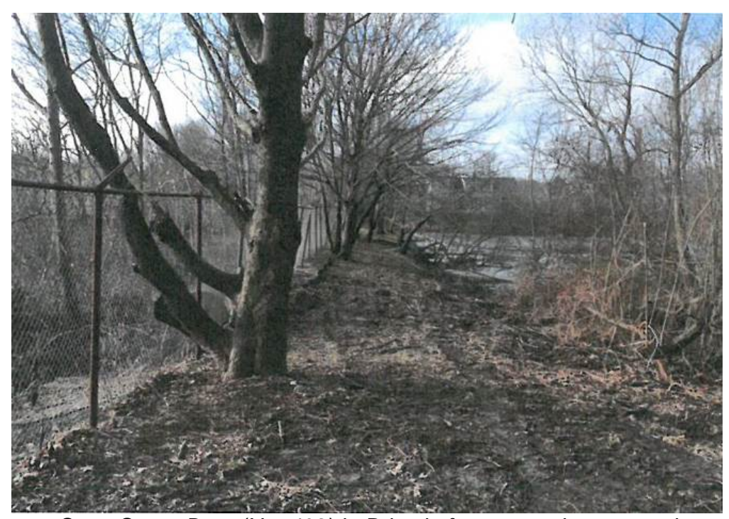
State Street Dam (No. 409) in Bristol after vegetation removal

The dam was inspected in 2013 and DEM issued a Notice of Violation (NOV) to the Town of Bristol in July 2016 for the unsafe conditions. The Town did not request a hearing on the NOV. However, the Town worked toward compliance in late 2016 and the unsafe conditions were satisfactorily addressed in 2017.