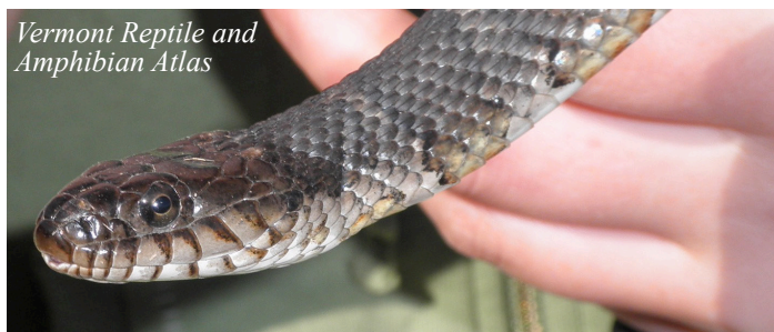
Vertical bars are present along the "lips" of non-venomous water snakes but are lacking in venomous cottonmouths.

It is important to note that vertical pupils in snakes, even venomous snakes, can appear to be round when dilated. These characteristics, along with the "triangle-shaped" head are all imperfect indicators of venomous species.