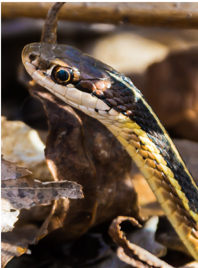
BrutcherSP - CC BY 2.0

Similar species: Northern watersnakes have keeled scales. Juvenile eastern ratsnakes and black racers lack bright coloration.