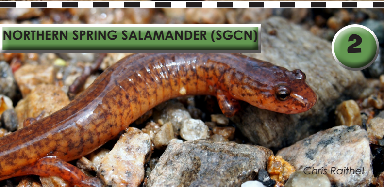
NORTHERN SPRING SALAMANDER (SGCN)

Biologists need to keep track of my populations. I am a game species, so it's important to be strict about hunting rules so that I am not overharvested. Habitat protection is super important too!