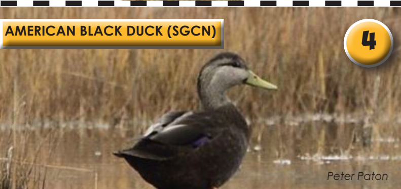
AMERICAN BLACK DUCK (SGCN)

Climate change will cause the temperature of the ocean to rise, which is not good for me! Scientific work to slow down climate change will be really helpful to me and many other species. Protecting our salt ponds and marshes, and keeping the bay clean are also very important.