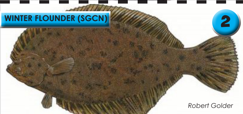
WINTER FLOUNDER (SGCN)

Please protect my forest home and don't invite me to your backyard by leaving out pet food or small pets like chickens and rabbits. I don't know any better and think they are free meals! Help spread the word that predators have an important job in the ecosystem.