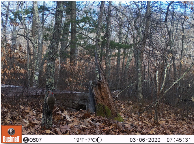
Can you spot the bird in this photo? Look for a bright splash of red on the tree trunk. It's a Northern flicker! Flickers are a common woodpecker species in Rhode Island. When they fly, you can see a bright flash of yellow on their wings. Dead trees and stumps are perfect places for woodpeckers to find a breakfast of bugs!