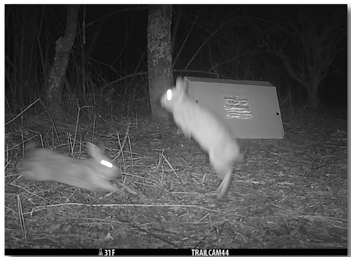
Action shot! Cottontail rabbits will hop and run around each other for a couple of reasons. Males battle each other to show who's boss. Males and females also do this type of hopping behavior during the breeding season to pick a mate.