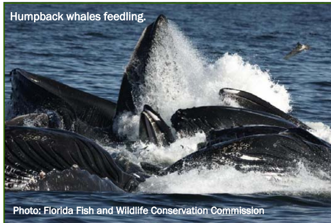
Humpback whales feeding.

Temporal and spatial patterns in zooplankton concentrations have resulted in inter-annual variations of traditional high use areas by the whales. In 1998, large concentrations of right, humpback and fin whales appeared in the Rhode Island/Block Island Sound