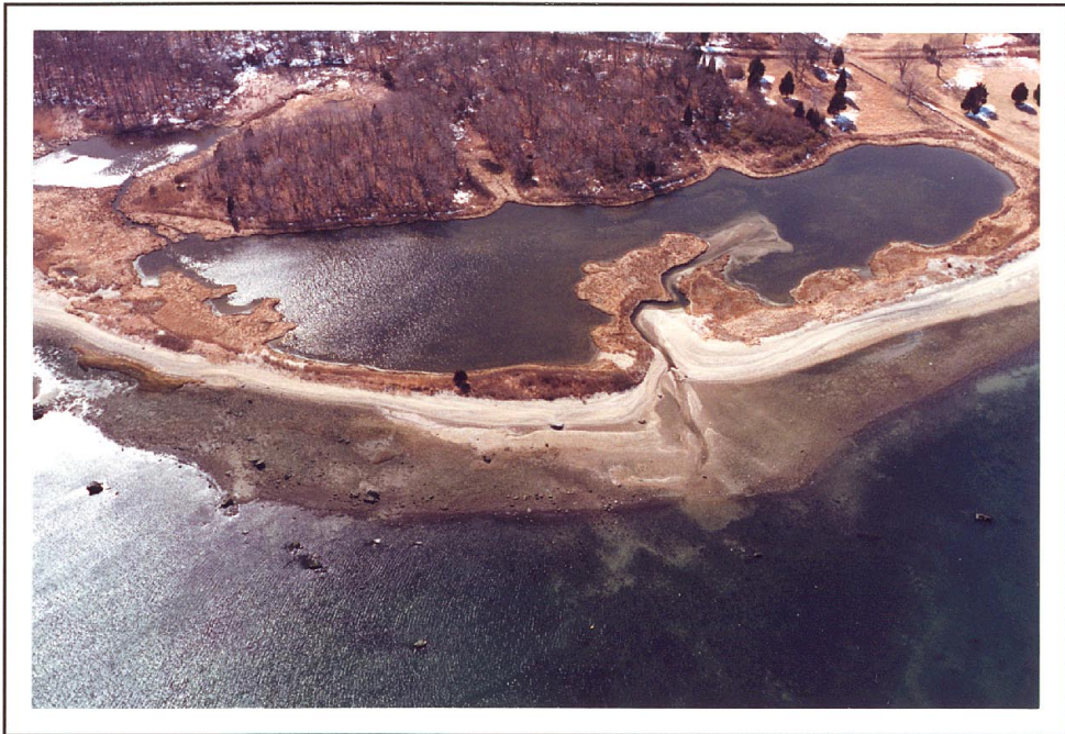
Looking west at low tide on 17 March 1999, Greene Point (#20).