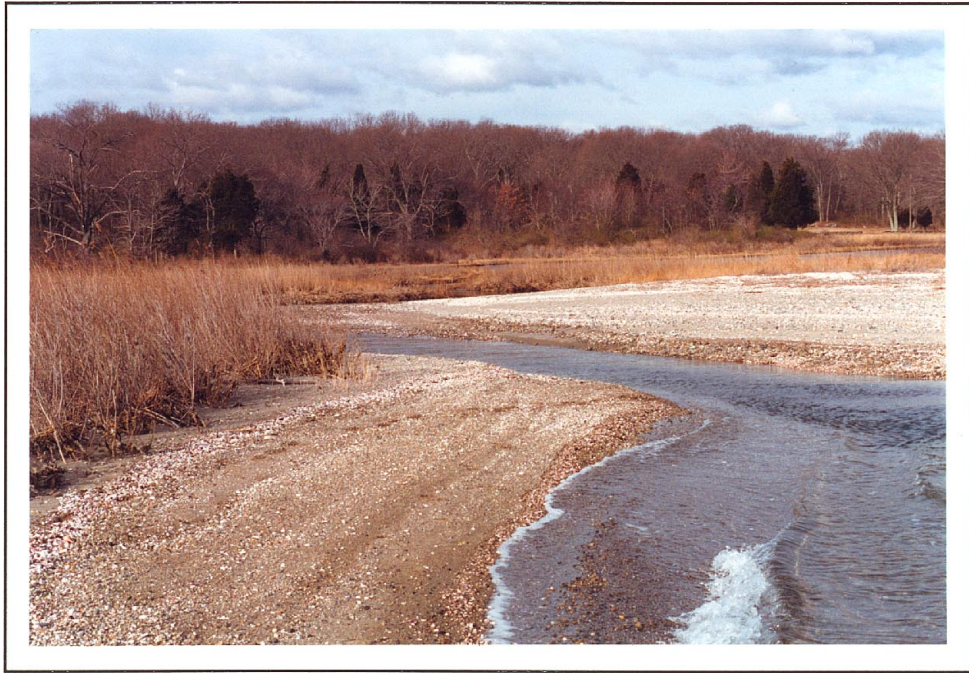
Looking NNE at channel at proposed sediment dike location at near high tide on 19 March 1999, Greene Point (#20).