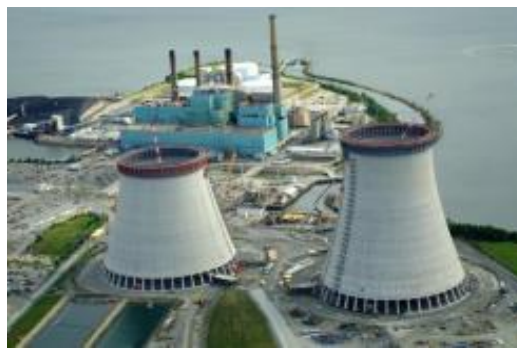
Brayton Point closed-cycle cooling towers

Thermal discharges from Brayton Point Station in Somerset MA, once the largest fossil fuel burning power plant in New England, led to elevated temperatures and reduced fish abundance in Mt. Hope Bay, and inclusion on the state's 303(d) List in 2000. To address the thermal impacts to Mt Hope Bay, the plant converted to closed-cycle cooling in May 2012. Available data from June 2012 to December 2015 following the plant's conversion to closed-cycle cooling document compliance with RI's