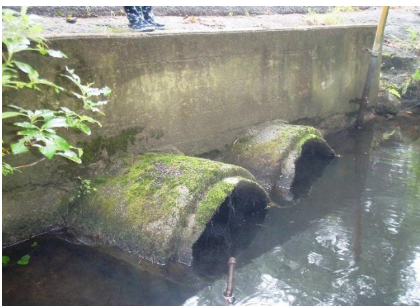
Undersized culverts restrict flow potentially leading to erosion, debris backup, and flooding and blocks movement of fish and other aquatic life

The state Narragansett Bays and Watershed Restoration Fund, established in 2004, has supported matching grants for water quality and habitat restoration projects and more recently has included flood mitigation projects that incorporate environmental co-benefits. Voters have approved a total of $18,500,000 in state bonds for this program over the years. Examples of