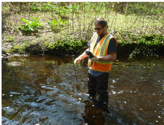
RIDEM ARM sampling Carr River, West Greenwich

http://www.dem.ri.gov/pubs/qapp/ambirivr2.pdf . The ARM program rotated to the Clear/Branch/Blackstone/Woonasquatucket Rivers watersheds in 2019 and is expected to rotate to the East Bay, Aquidneck Island, and coastal Bay tributaries in 2020, depending on funding and resources.