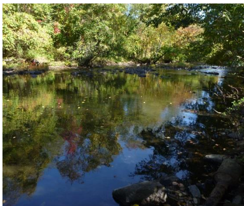
Branch River at Douglas Turnpike, Burrillville

Of the impaired river miles (731.2 miles), most impaired river miles (93.9%, 686.3 miles) have a pathogen impairment. The second most prevalent cause of impairment are metals with 27.3% (200.0 miles) of impaired river miles. The metal with the highest percent of impaired river miles (14.1%, 103.4 miles) is dissolved lead. Additional notable causes of river impairments are Nuisance Exotic Species (14.4%, 105.2 miles) and Biologic Integrity (10.3%, 75.0 miles).