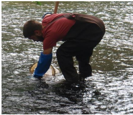
RIDEM collection of aquatic organisms (macroinvertebrates) using a net

In the lower Woonasquatucket River, water quality improvements are evident from the improved condition of aquatic organism communities living in and on the bottom of the river.