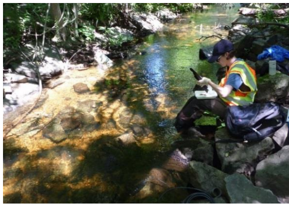
RIDEM sampling Frenchtown Brook, East Greenwich for algae in numeric nutrient criteria development

its compact state size, RIDEM is fortunate to have been able to assess the majority of the state's surface waterbodies. However, it will be critical to sustain investment in existing monitoring efforts to avoid the development of future data gaps. In addition, further investment to enhance monitoring programs will be needed to support adaptive management decision-making and move Rhode Island closer to the goal of comprehensively assessing the state's surface waters.