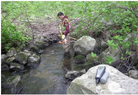
RIDEM sampling Sucker Brook, Tiverton for water chemistry, bacteria, and metals

In rivers and streams, the major source of information for the freshwater river assessments in this report is the Rhode Island Department of Environmental Management (RIDEM)'s Ambient River Monitoring (ARM) program. This program is