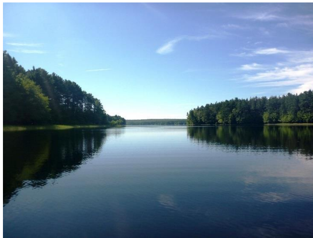
Scituate Reservoir, Scituate

The Rhode Island Department of Health (RIDOH), Office of Drinking Water Quality (DWQ) is delegated to administer the EPA's Safe Drinking Water Act. The Office of Drinking Water Quality (DWQ) monitors approximately 490 public water systems, which include surface and groundwater supplies. DWQ monitors drinking water quality at the source, at the entry to the distribution system, and within the distribution system to evaluate for compliance. The larger public drinking water suppliers monitor the source waters for several parameters to adjust treatment levels as necessary for compliance. More information about RIDOH's DWQ program can be found at http://www.health.ri.gov/programs/drinkingwaterquality/ .