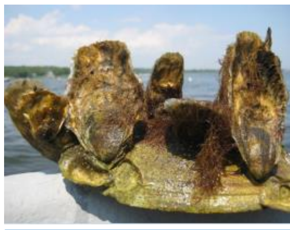
In 2016, RI had 70 aquaculture farms which generated just over $5.5million in sales of products

Clean water is essential to supporting important sectors in Rhode Island's economy. Rhode Island's coastline is a critical economic asset for marine-based commercial activity including recreational tourism, boat building, and commercial fishing. An analysis by University of Rhode Island (URI) estimates the total economic impact of these businesses in 2016 was at $2.6 billion in sales and another $118 million in local and state tax revenue. Similarly, URI, in collaboration with the Commercial Fisheries Research Foundation and RIDEM, estimated the RI fisheries and seafood section generated $538 million in gross sales in 2016. See https://riepr.org for details.