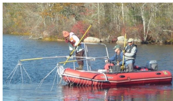
RIDEM samples fish tissue in collaboration with state and federal partners

Progress has also been made to advance numeric nutrient criteria by initiation of a method development project. Under the ARM umbrella, some stations were also sampled to determine what type and what kinds of algae are present in Rhode Island streams, along with other factors that influence algal growth in streams, such as canopy cover and substrate availability.