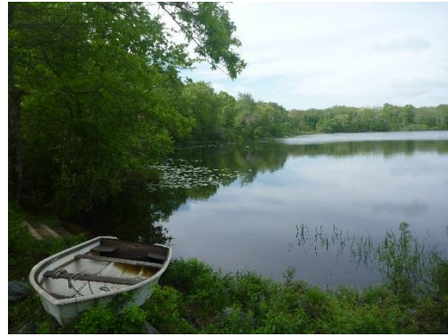
Peace Dale Reservoir, South Kingstown

Of the impaired lake acres (11,028 acres), the highest cause of impaired lake acres is metals (61.4%, 6,772.9 acres), with the highest metal impairment being mercury in fish tissue (54.5%, 6008.5 acres). The second most prevalent cause of impaired lake acres are Nuisance Exotic Species with 47.8% (5,275.6 acres). The other highest percentage of lake acre impairment causes are Nutrients (30.2%, 3,334.1 acres) and causes associated with nutrient impairments such as Chlorophyll-a, Excess Algal Growth, and Total Organic Carbon (19.6%, 2,162.3 acres) and Oxygen Depletion (14.6%, 1,613.3 acres).