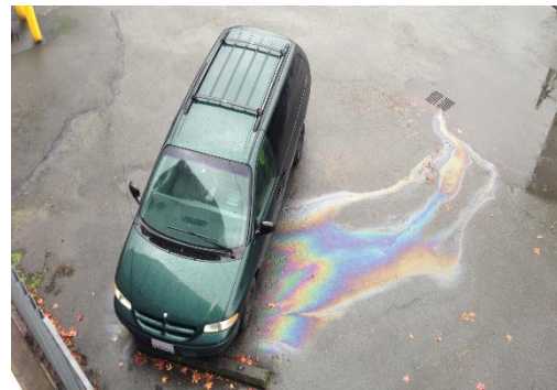
Stormwater is concentrated into drains and pipes bringing pollutants with it

Untreated stormwater discharges constitute a widespread and major pollution concern in RI associated with beach closures, shellfish closures, and other adverse impacts to aquatic ecosystems. Runoff from a wide range of land uses, e.g. urban, suburban, industrial and agricultural contributes to water quality degradation and has been implicated as a source of pollutant loadings in a majority of the TMDLs completed in RI. Given the density and pattern of land development in the state, strategies to address stormwater management must involve both prevention and abatement; e.g. retrofit programs.