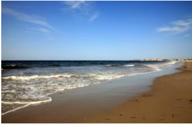
East Matunuck State Beach, South Kingstown

The Rhode Island Department of Health (HEALTH) is responsible for the licensing and regulating of bathing beach facilities in the state of Rhode Island. This includes both fresh and saltwater beaches. Funding for the Beach Program is provided by the EPA. These funds support primary Beach Program activities which include: sanitary surveys, development and implementation of a risk-based monitoring plan, bacteriological testing at marine beaches, and a public notification system. Currently, the EPA does not provide funds to monitor