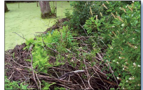
Figure 2. An algal bloom is visible behind a beaver dam constructed at the outlet of Arrow Swamp.

Watershed Watch is led by the University of Rhode Island's (URI) Department of Natural Resource Sciences and URI Cooperative Extension through collaboration with URI Coastal Fellows, URI College of the Environmental and Life Sciences, RIDEM, the Wood-Pawcatuck Watershed Association, local sponsors, and the federal government. The program is aimed at providing training and equipment to volunteer "citizen scientists" who conduct multi-year surface water quality monitoring according to strict quality assurance procedures. For more than two decades, Watershed Watch has used CWA section 319 funds under a contract with RIDEM. RIDEM currently provides approximately $50,000 annually in CWA section 319 funds to support the Watershed Watch program.