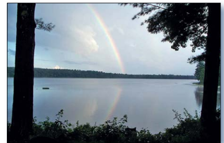
Figure 3. Phosphorus levels in Yawgoo Pond have declined.