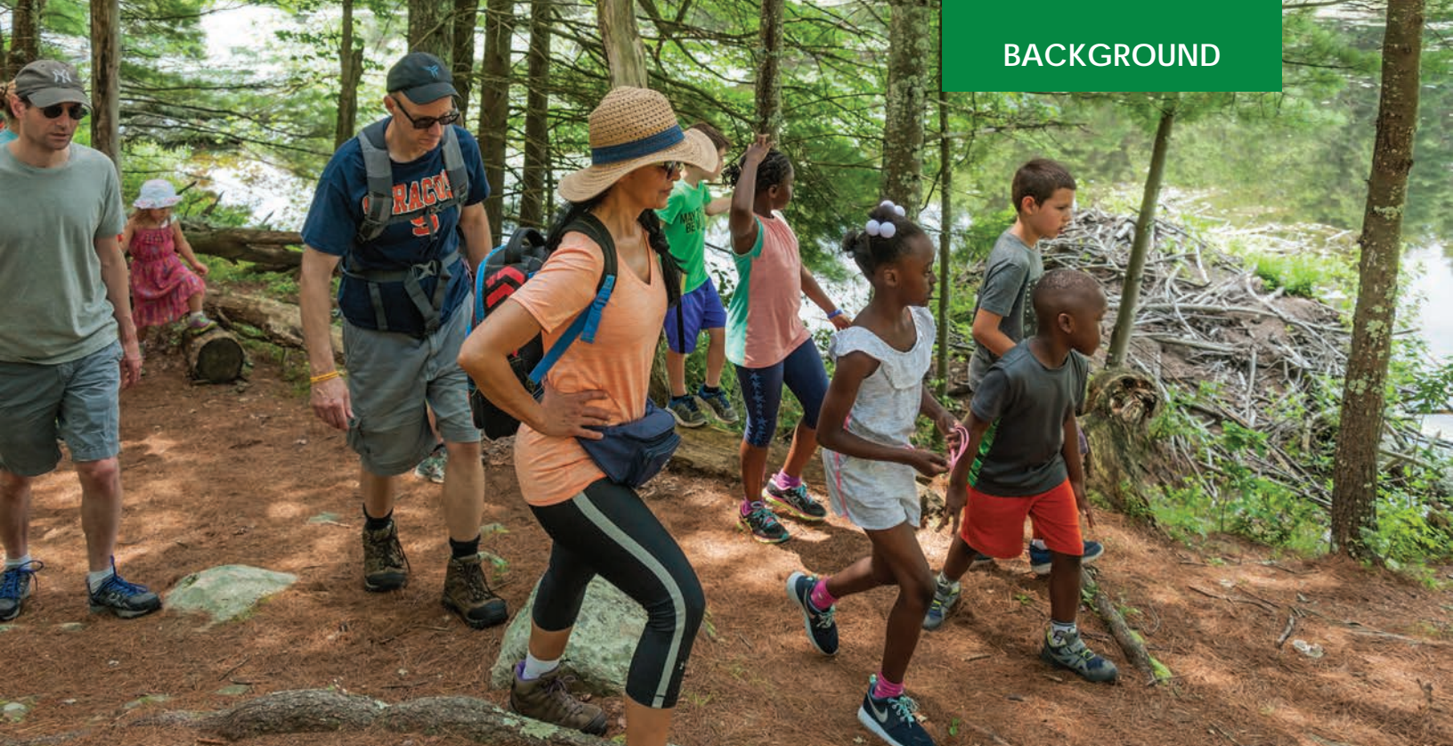
Guided nature hike at Pulaski State Park