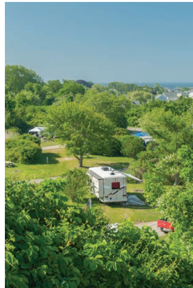
Campground at Fishermen's Memorial State Park