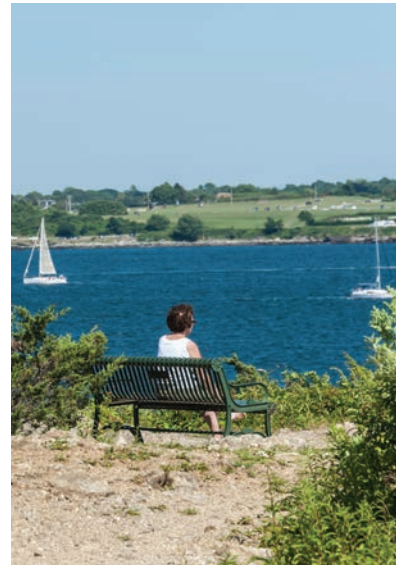
Fort Wetherill State Park in Jamestown