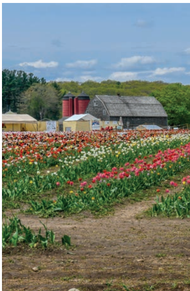
Tulip farm at Snake Den State Park in Johnston