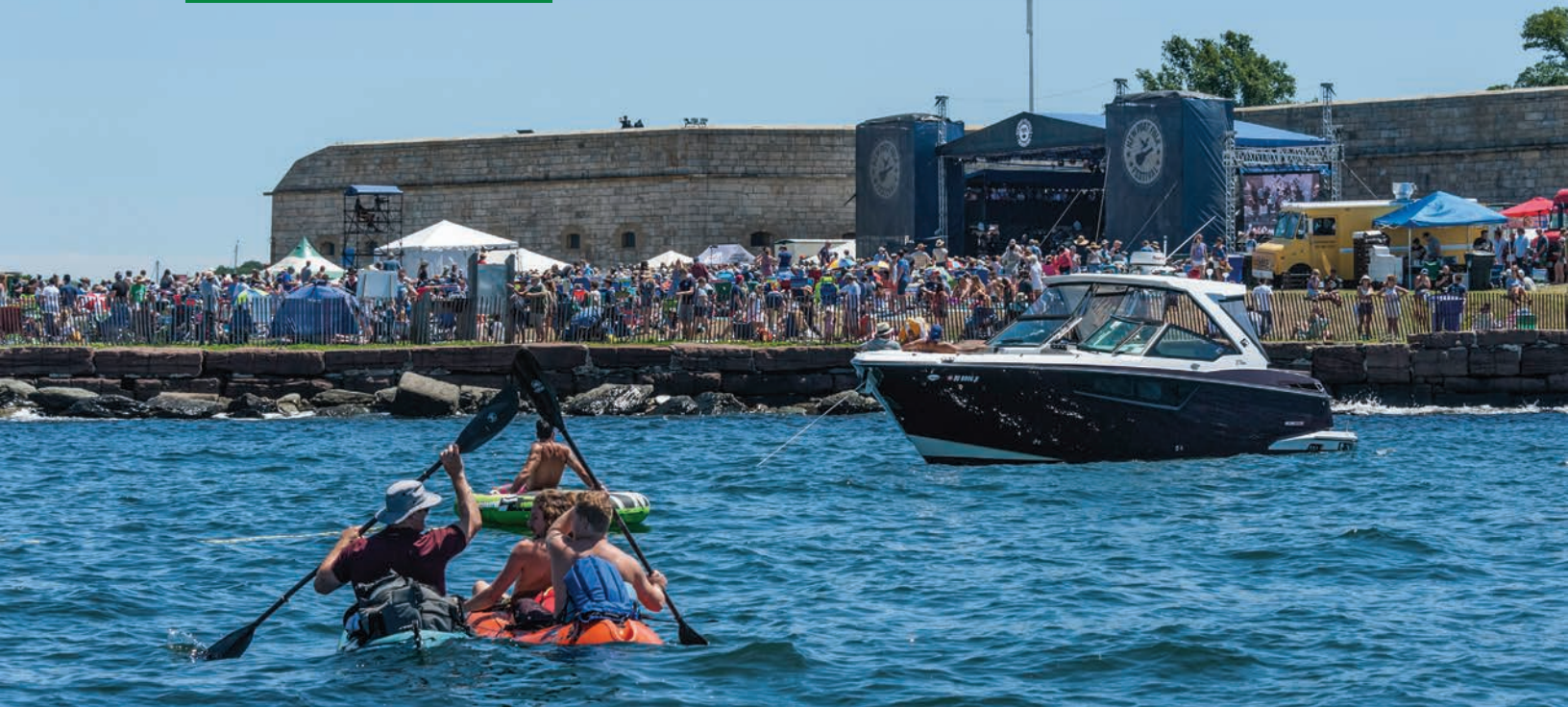
Newport Folk Festival at Fort Adams State Park in Newport