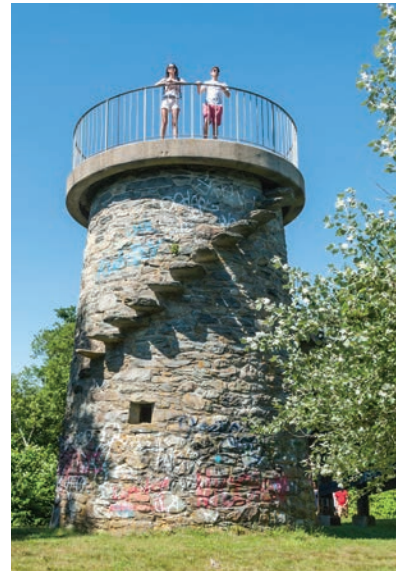
Brenton Point State Park in Newport