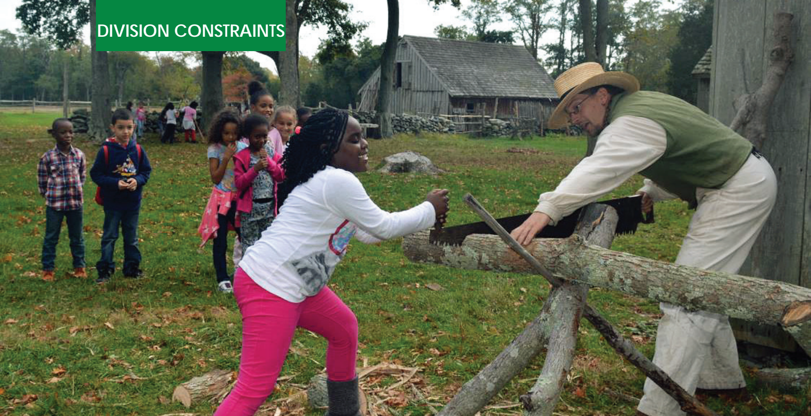
Educational program by Coggeshall Farm Museum at Colt State Park in Bristol