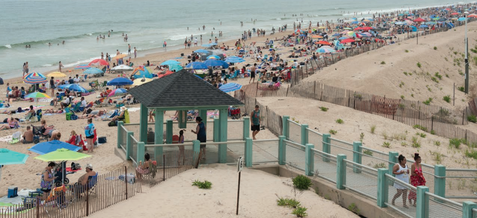
Misquamicut State Beach in Westerly