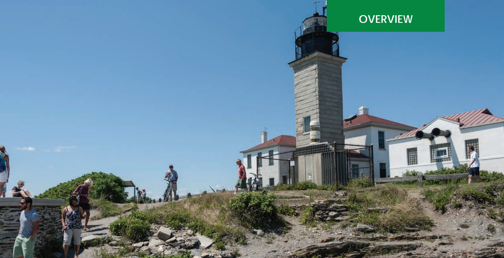
Beavertail State Park in Jamestown