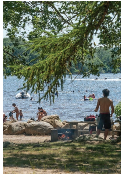
Burlingame State Park & Campground in Charlestown