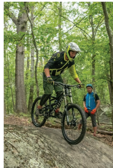
Mountain biking at Lincoln Woods State Park

This study represents the staffing and operations analysis recommended by the ORC. The report provides an objective assessment and corresponding recommendations to support continued investment in and preservation of Rhode Island State Parks. The intent is to guide in the delivery of excellent parks, trails, public facilities, activities, programs and services that will contribute to public health and enjoyment, location, community prosperity, and quality of life, while also enhancing statewide tourism capabilities and opportunities.