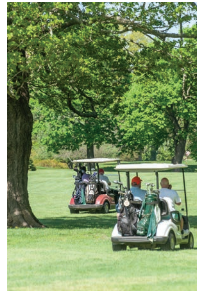
Golf Course at Goddard Memorial State Park

However, over the past 15 years, budget and staffing cuts, combined with heavy and increasing visitor use, aging facilities, and expanded responsibilities, threaten DEM's ability to provide residents and tourists with well-maintained and accessible recreation facilities and opportunities.