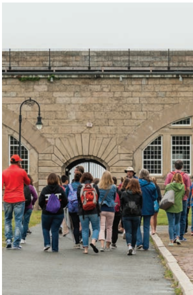
Tour group at Fort Adams State Park in Newport