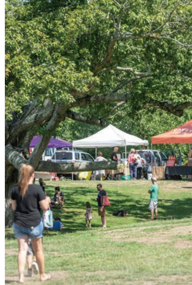
Goddard Memorial Farmers Market