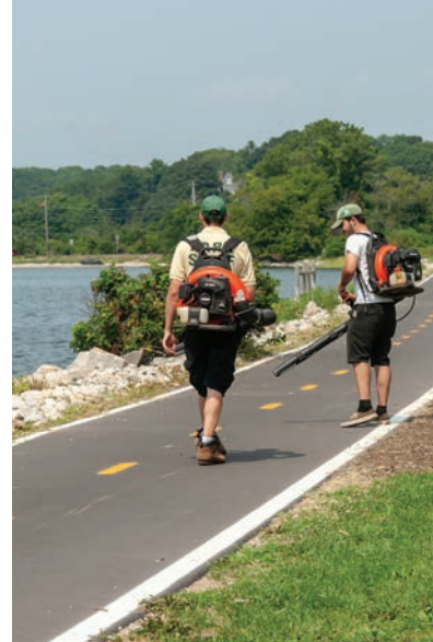
Parks staff performing maintenance work on the East Bay Bike Path