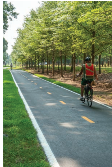
East Bay Bike Path

Now is the time to transform Rhode Island State Parks into a modern and dynamic system with the resources, structure, and tools needed to advance its mission and protect its assets to better serve the Rhode Islanders and tourists who visit them. With several foundational and philosophical shifts, the Rhode Island State Park system will be well-positioned to continue leveraging public assets while demonstrating the system's significance to the state's economic landscape. Moreover, these recommendations address the key challenges and opportunities that will have the most impact on sustainable park operations. Working together, Rhode Island's decision makers can optimize the value and benefits of the incredibly diverse system and create a model for public agency excellence and innovation.