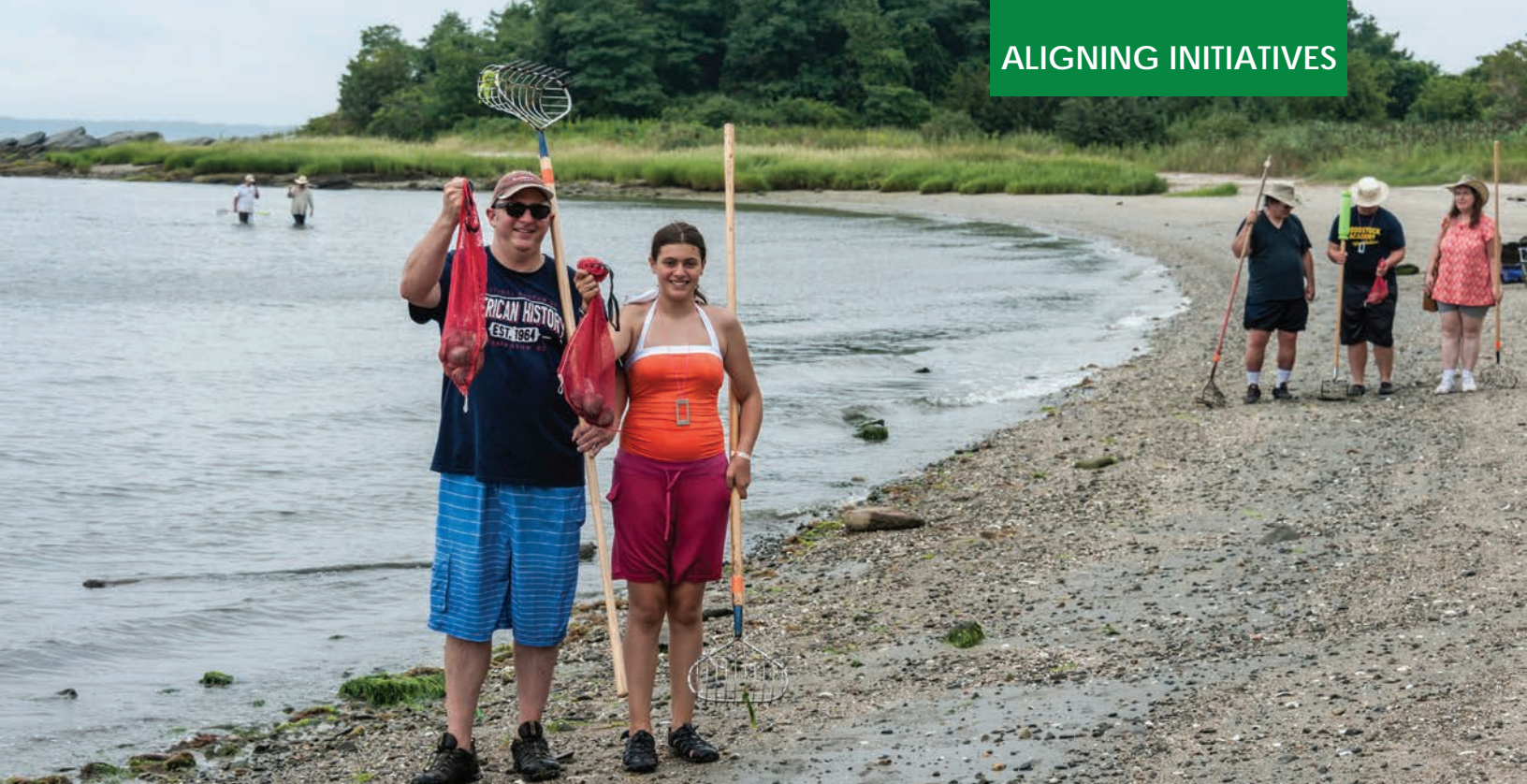
Clamming at Rocky Point State Park

The Rhode Island State Park system is at a critical crossroad. Without a concerted effort to increase staffing and funding, the system will continue to deteriorate, and the Department will be unable to keep some facilities open and adequately staff and maintain others.