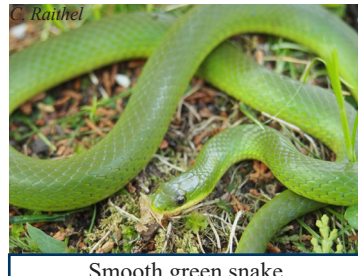
Smooth green snake (Opheodrys vernalis)

For detailed information about each species, check out the <u>Snakes of Rhode</u> <u>Island fact sheet</u> from RI Division of Fish and Wildlife.