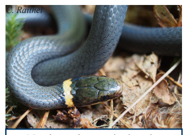
Northern ring-necked snake (Diadophis punctatus edwardsii)