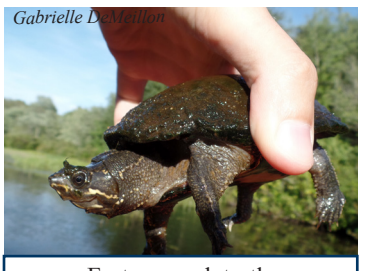
Eastern musk turtle (Sternotherus odoratus)