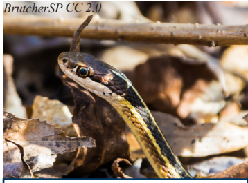
Eastern ribbon snake (Thamnophis sauritus sauritus)