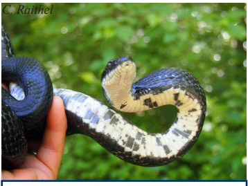
Eastern rat snake (Pantherophis alleganiensis)