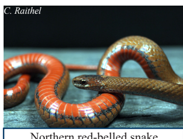
Northern red-belled snake (Storeria occipitomaculata occipitomaculata)