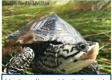
Northern diamond-backed terrapin (Malaclemys terrapin terrapin)