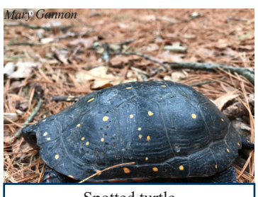
Spotted turtle ( Clemmys guttata )