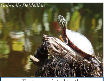
Eastern painted turtle ( Chrysemys picta picta )