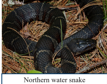
(Nerodia sipedon sipedon)