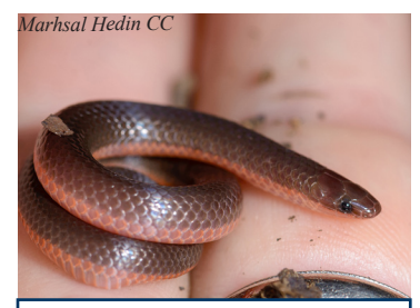
Eastern worm snake (Carphophis amoenus amoenus)