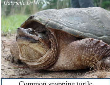
Common snapping turtle ( Chelydra serpentina )