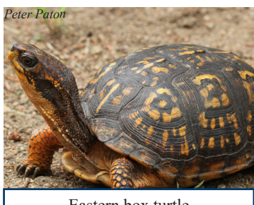
Eastern box turtle ( Terrapene carolina carolina )

Turtles are one of Rhode Island's most charismatic animals. They are typically well loved and appreciated, but their needs are not often well understood. Habitat loss, fragmentation and poaching threaten our native turtles. Seven species of turtles live in Rhode Island, some spend their lives in freshwater ponds and streams, while others live almost entirely on land. Four species of sea turtles visit our coasts, Kemp's ridley ( Lepidochelys kempii ), leatherback ( Dermochelys coriacea ), loggerhead ( Caretta caretta ) and green sea turtle ( Chelonia mydas ). All of the turtles that spend even a fraction of their lives in our state depend on us to protect their populations and their habitats.