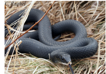
Northern black racer (Coluber constrictor constrictor)