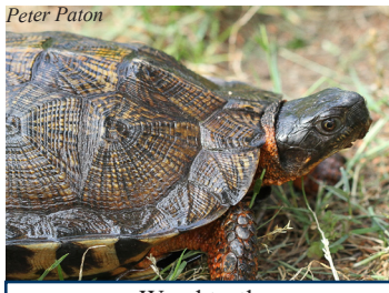
Wood turtle ( Glyptemys insculpta )

For detailed information about each species, check out the <u>Turtles of Rhode</u> <u>Island fact sheet</u> from RI Division of Fish and Wildlife.