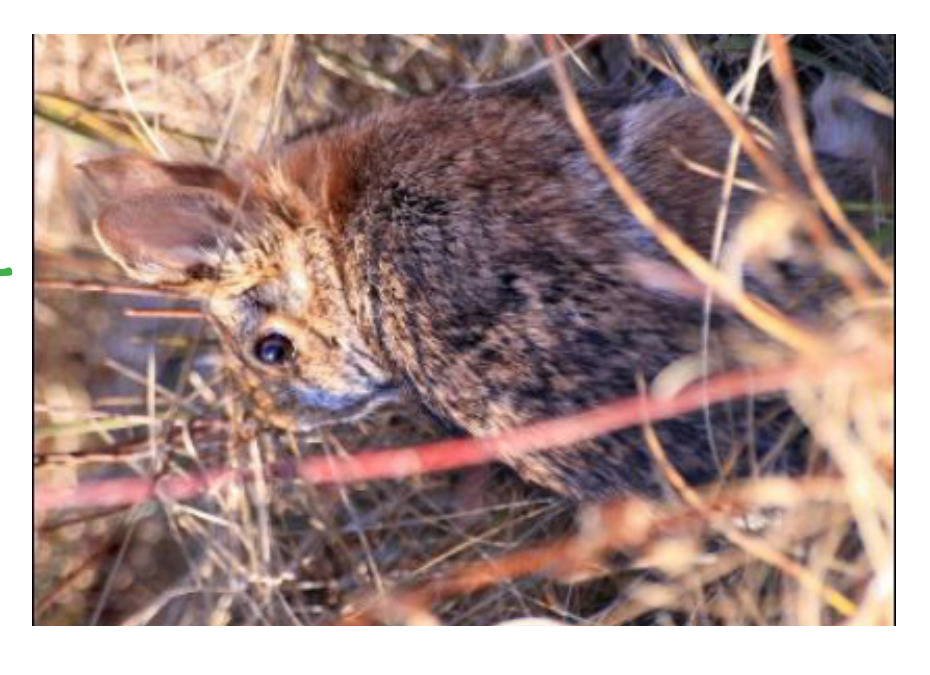
New England Cottontail