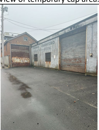
View of temporary cap area.

If you have any questions or concerns, please contact the undersigned at 401-723-9900.