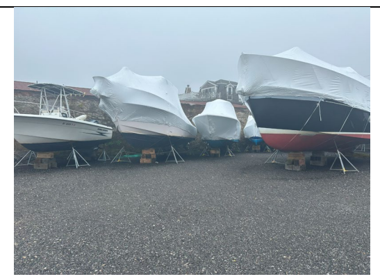
View of temporary cap area.