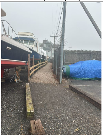
View of temporary cap area.