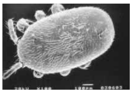
Electron micrograph of T. clareae

Native of Asia, Asian Bee Mites are a pest of the giant honey bee and European honey bee. These Parasitic Bee Mites affect both developing brood and adult honey bees and are currently not present in the United States.