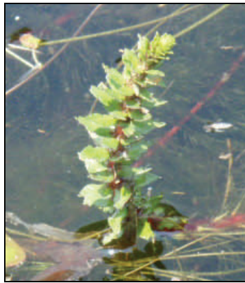
Emergent spike with bracts and flowers