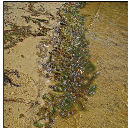
Fragments of variable milfoil washed ashore