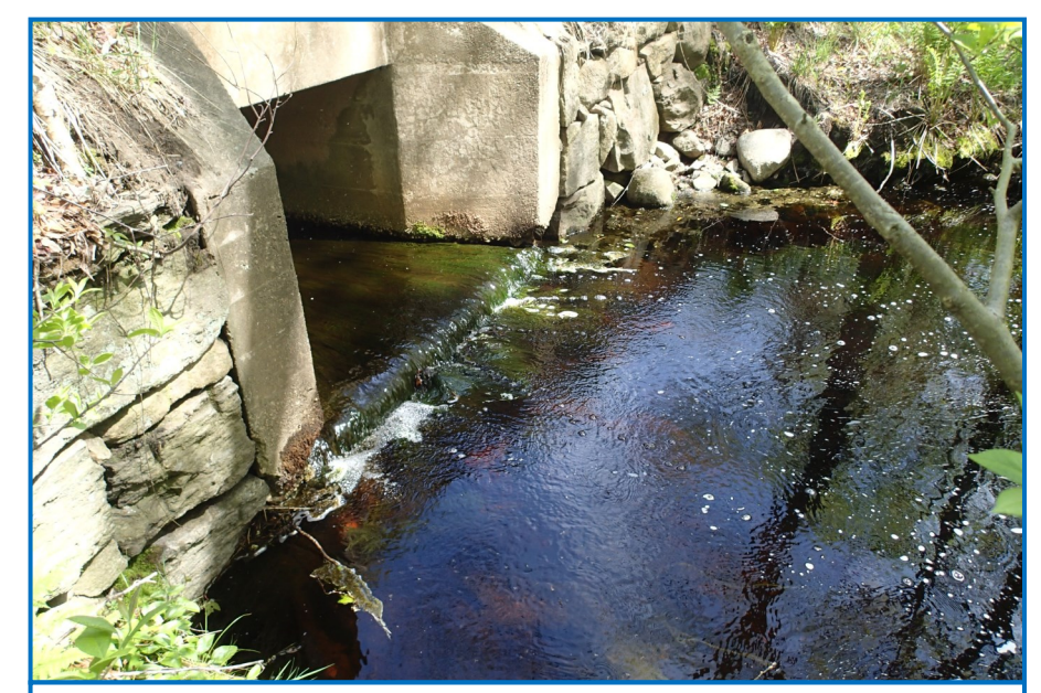
Dam removals are an ideal resolution for restoring natural flow of streams and rivers and the associated connectivity for organism passage.

terms of an entire stream or river population, reduced dispersal and movement put the organisms at a greater risk for a decline and even extirpation: the disappearance of a species from an area where it once thrived. Fish ladders, which allow fish to travel around the barrier, are installed at dams and other blockades where passage provides significant ecological, recreational, or commercial importance. The fish ladders often provide efficient passage for a target species, but passage by other fish or aquatic organisms can be difficult or impossible. Dam removals are an ideal resolution for restoring the natural flow of streams and rivers and restoring connectivity for animals to pass freely. More and more culvert re-