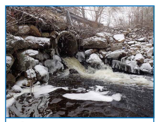
Culverts and dams which act as barriers can have varying effects to species, including limiting migration, reducing access to spawning habitat, and limiting forage availability.

Streams contain a variety of habitats which provide unique accommodations for different species. Even for a single species, different life stages require specific habitat requirements for survival. In addition to fish, streams are home to a variety of amphibians, invertebrates and even mammals, which all play a role in the ecosystem. Culverts and dams which act as barriers can have varying effects on species by limiting migration, reducing access to spawning habitat, and limiting forage availability. To put this in perspective, imagine if