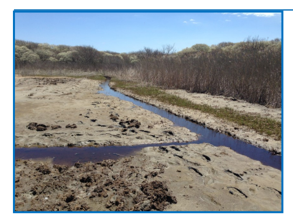
Small channels improve tidal flushing and help drain fresh water that had become impounded at upper sections of the high marsh.

These ecosystems are typically distinguished into two areas as low marsh and high marsh habitat. Low marsh habitat is almost always inundated at high tide, while high marsh habitat is less frequently flooded, usually by the highest tide. This results in differing levels of salinity, moisture content, and soil composition. These factors determine what types of vegetation will grow in specific areas; grasses are more common in low marsh areas while high marsh habitat tends to consist of more low-growing shrubs. The vegetation within salt marshes provides critical nesting habitat for birds like the salt marsh sparrow (Ammodramus caudacutus), seaside sparrow (Ammodramus maritimus), and willet (Tringa semipalmata). Salt marshes are also beneficial to humans as they protect coastlines from erosion, and filter sediment from the water as the tide ebbs and flows.