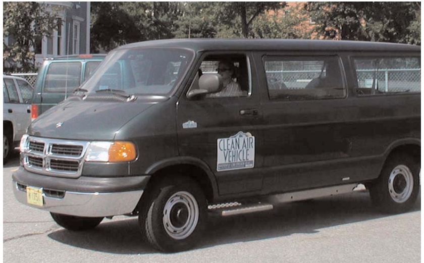
DEM's fleet now includes 40 green vehicles.

Members of the Rhode Island Greenhouse Gas Stakeholder Process developed this Executive Order along with the Order for green state buildings discussed in the front-page article of this newsletter.