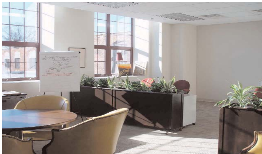
17 Gordon Avenue: This business incubator center in Providence features a solar panel system, green roof, rainwater recovery and reuse, porous asphalt parking lots, and a southern orientation for increased natural light (shown above).