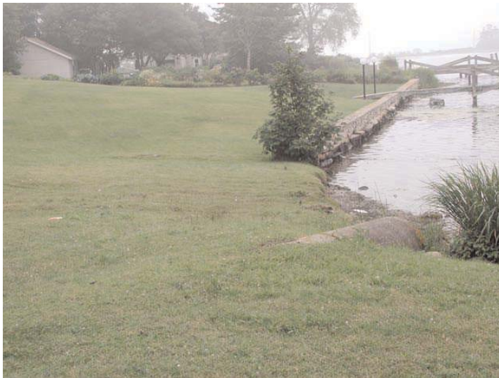
Buffer areas like this one along Greenwich Bay need to be improved to abate nutrient pollution.

of potential restoration parcels. Local watershed groups will contact property owners to determine whether they might have an interest in restoring their buffers. Restoration funding is currently available to private landowners.