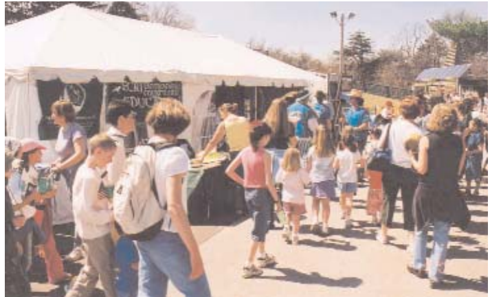
In 2004, Conservation Week and the Earth Day festival drew over 11,700 people to Roger Williams Park Zoo.

Earth Day Festival – Saturday, April 13 – 10:30 AM to 3:30 PM. Opportunity to promote your organization's programs Through displays and hands-on exhibits. RIPTA will provide free buses from Kennedy Plaza to the Zoo.