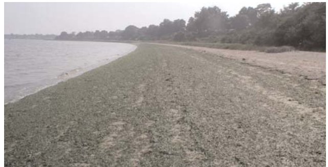
Decomposing seaweed on Greenwich Bay shores caused noxious odors and disposal problems in the Summer of 2004.