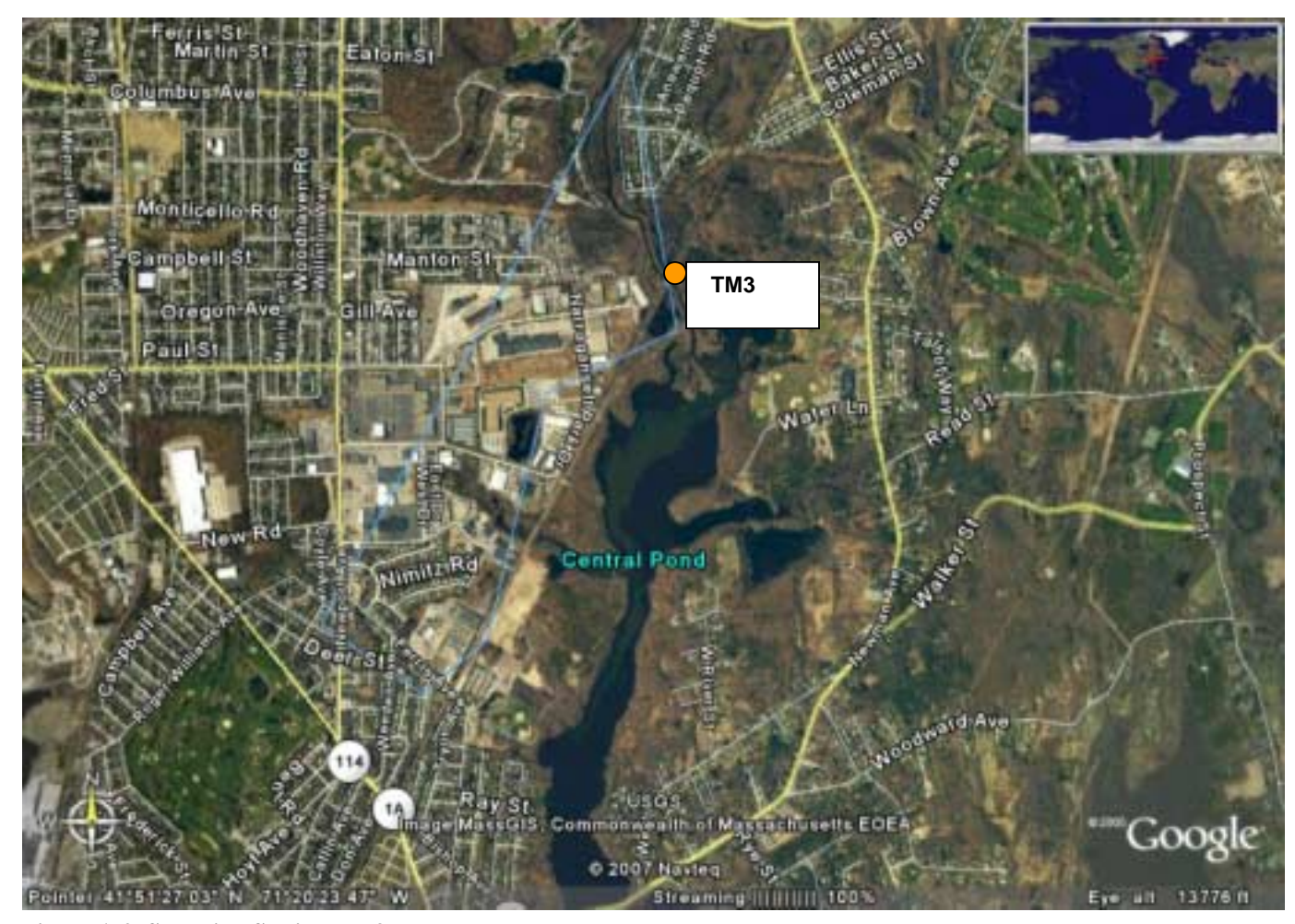
Figure A 2 Sampling Station TM3.