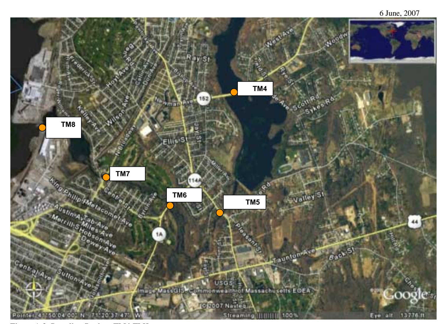
Figure A 3 Sampling Stations TM4-TM8.