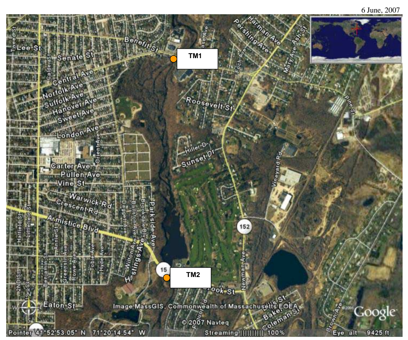
Figure A 1 Sampling Stations TM1 and TM2.