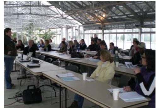
RI Residential Rain Garden Training participants receive instruction on proper garden design and installation.