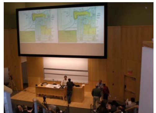
Over 100 participants attended the five-part Stormwater Standards Manual Training in 2011.