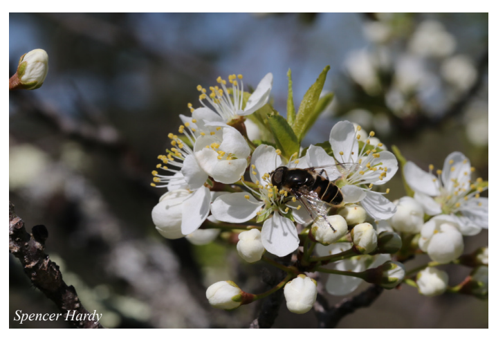
BLACK-SHOULDERED DRONE FLY (Eristalis dimidiata)

Habitat: This flower fly is commonly found in forests.