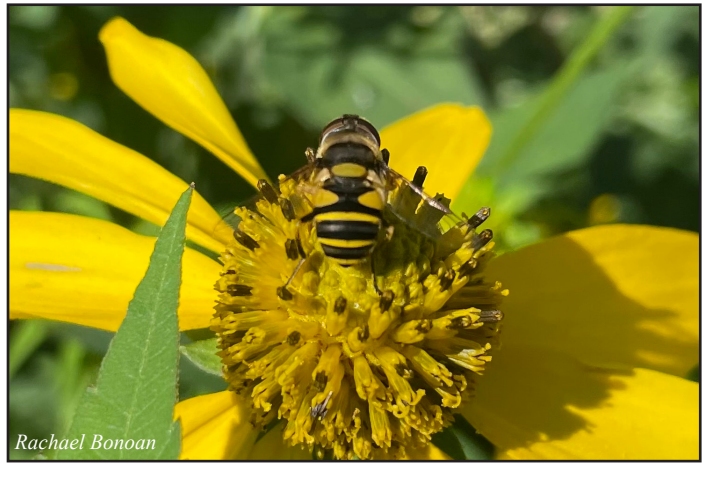
TRANSVERSE-BANDED FLOWER FLY (Eristalis transversa)

Larval food: The larvae of this fly feed on aphids and mites.