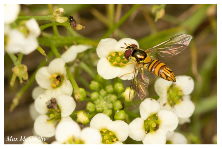
OBLIQUE STREAKTAIL (Allograpta obliqua)

Larval food: The larvae of this flower fly eat aphids, thrips, and caterpillars.