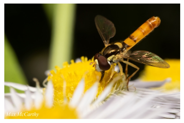
TUFTED GLOBETAIL (Sphaerophoria contigua)

Larval food: The larvae of this flower fly are aquatic and feed on small, aquatic organisms.