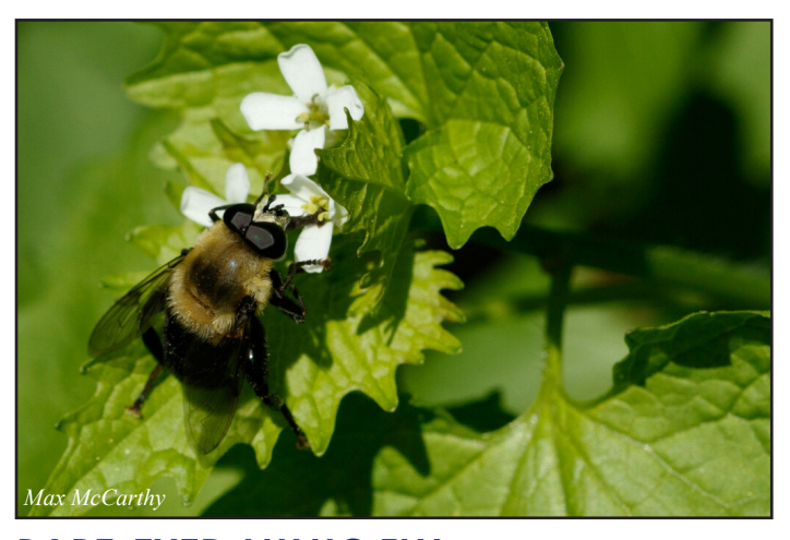
BARE-EYED MIMIC FLY (Mallota bautias)

Larval food: The larvae of this flower fly eat aphids, mites, caterpillars, psyllids, mealybugs, and whiteflies.