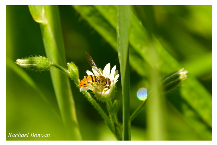
MARGINED CALLIGRAPHER (Toxomerus marginatus)

Habitat: This flower fly can survive in many habitats.