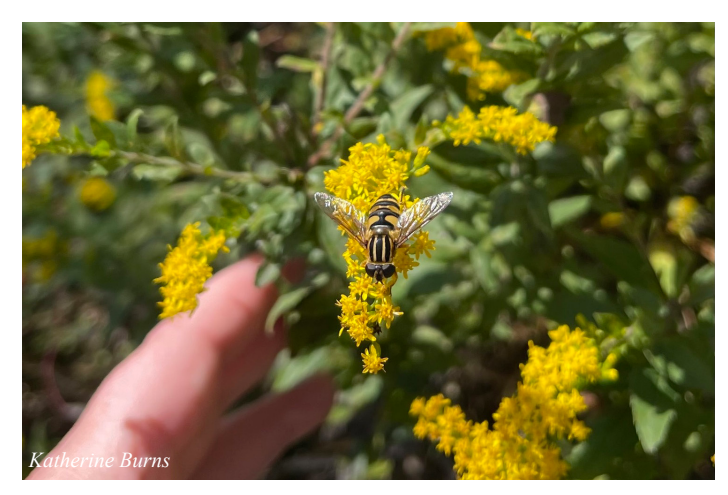
NARROW-HEADED MARSH FLY (Helophilus fasciatus)

Larval food: The larvae of this fly feed on aphids, mealybugs, thrips, and caterpillars.