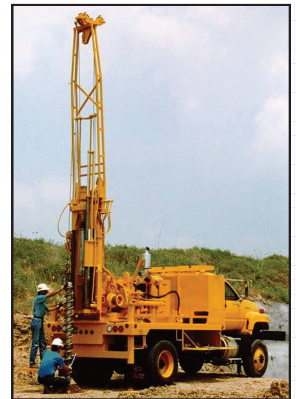
Typical truck-mounted drilling rig with hollow stem augers

FOR MORE INFORMATION, PLEASE VISIT WWW.TIDEWATERSITE.COM