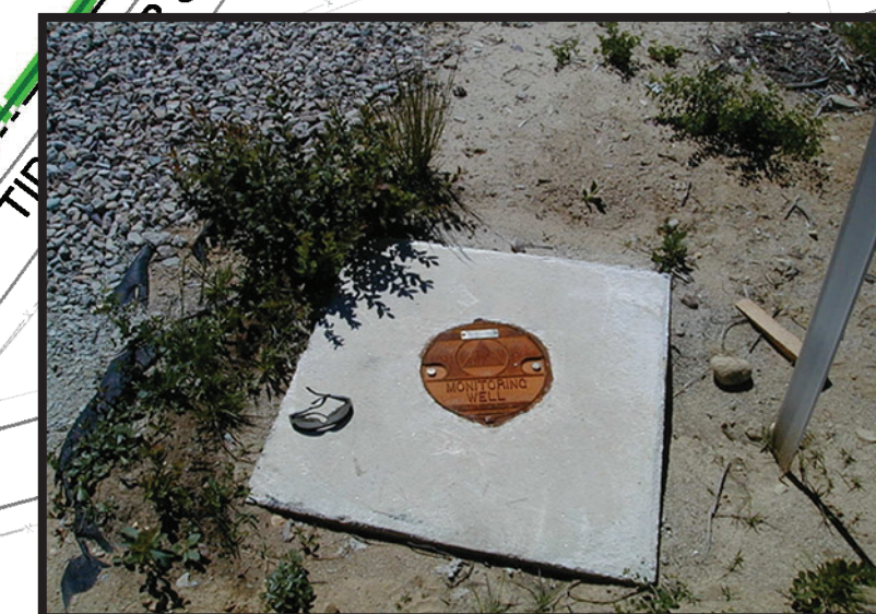
LEFT: Typical flush-mounted groundwater monitoring well RIGHT: Typical standpipe groundwater monitoring wells