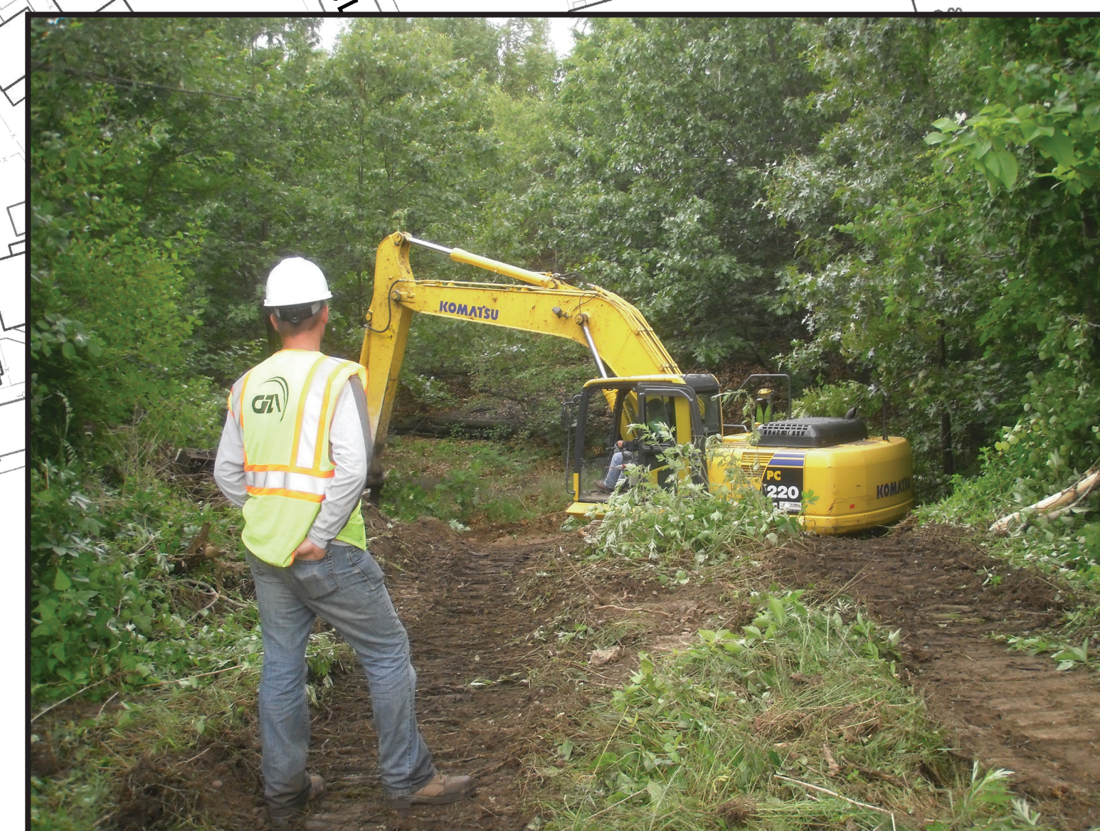
Typical test pitting activities